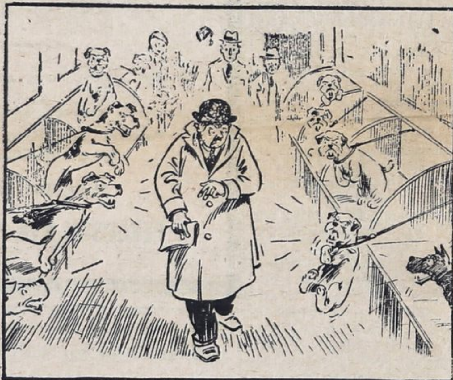
RUNNING THE GAUNTLET

An Exclusive Line of Ladies' Hats, Coats, Suits, Dresses, Hosiery and Lingerie HAILEYBURY Phone 22