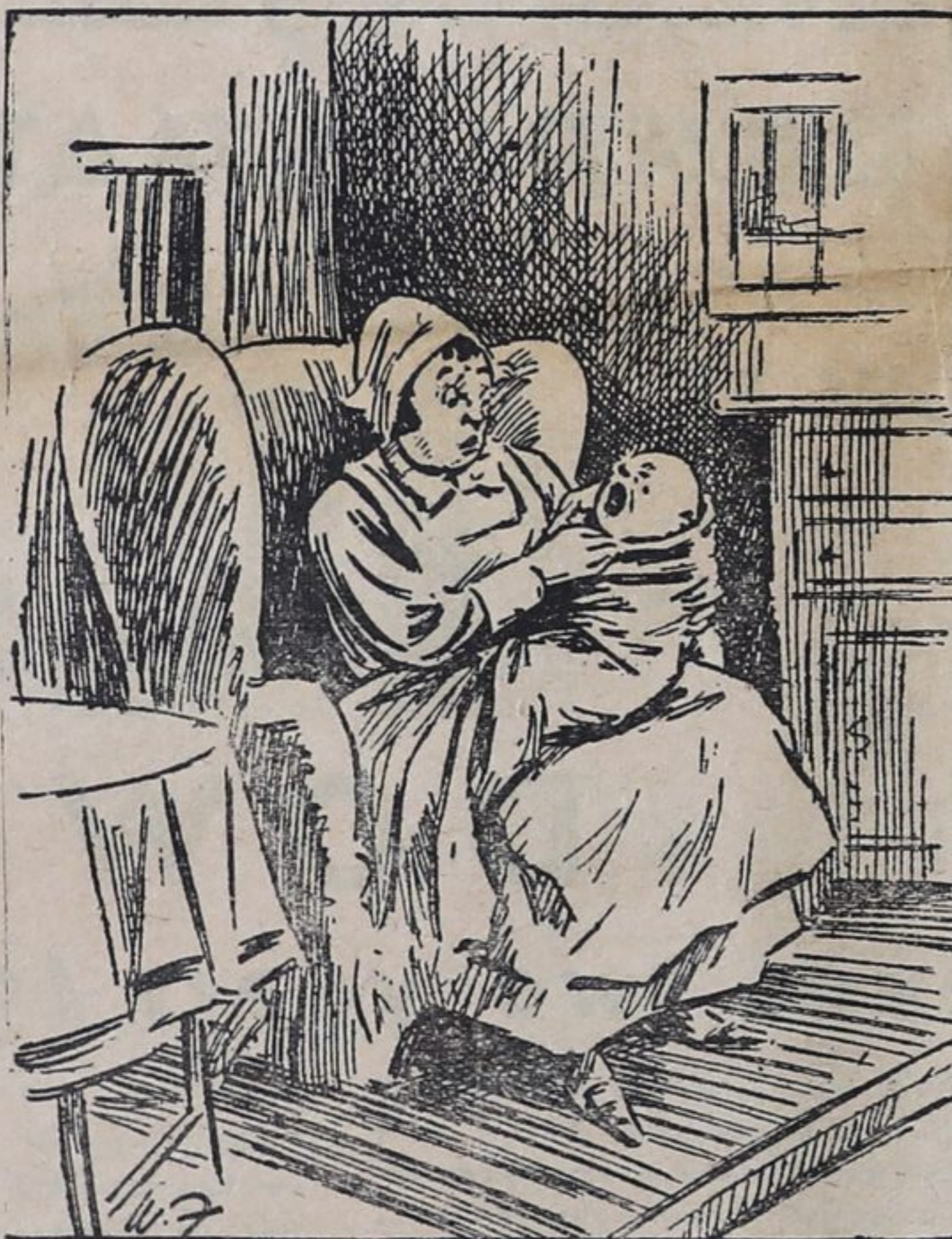
NURSE OF MILLIONAIRE'S BABY: "Oh dry up! 'Ood think you was worth half a million to hear you?" —The London Opinion.