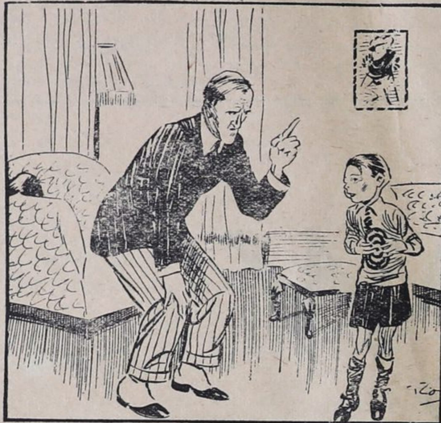
Father: "Now Bobby, don't let me ever hear you say 'Oh Yeah' again, or I'll stop you going to these American films." Bobby: "Okay, chief!"