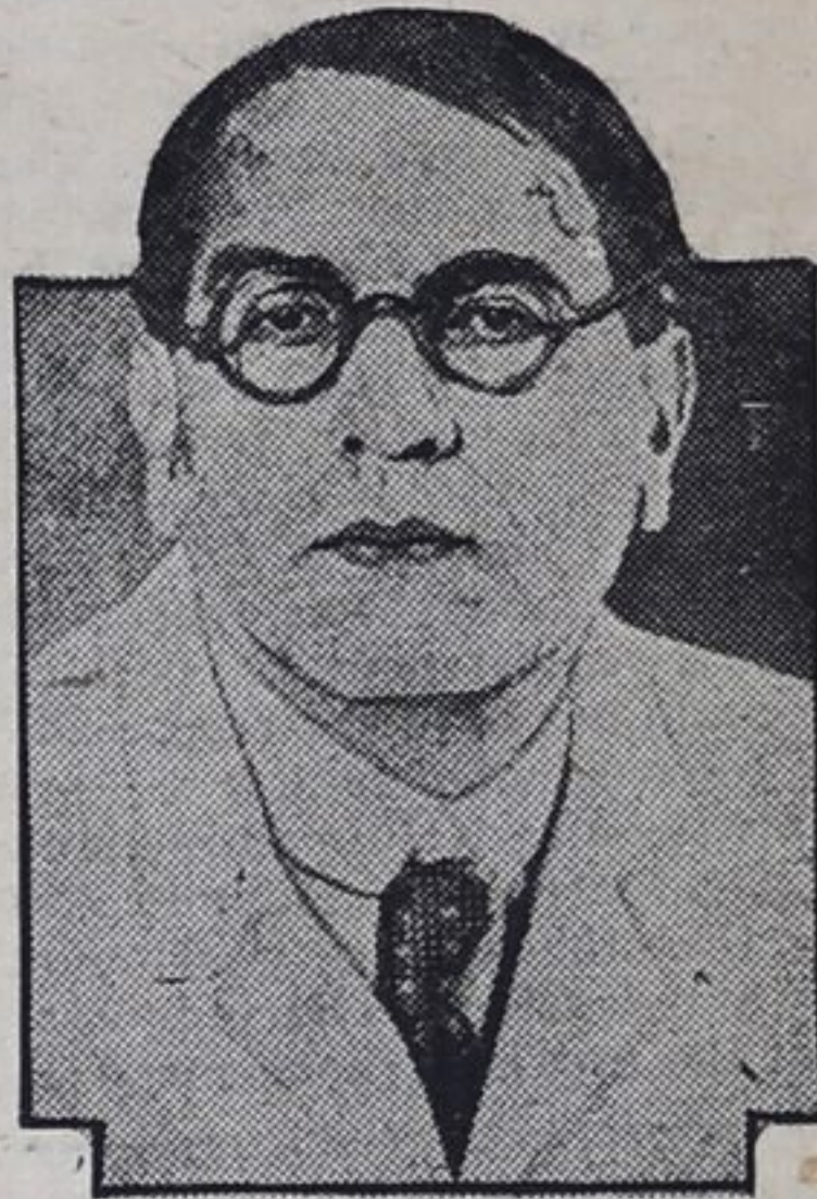
Test Shows Man Can Sleep All Winter