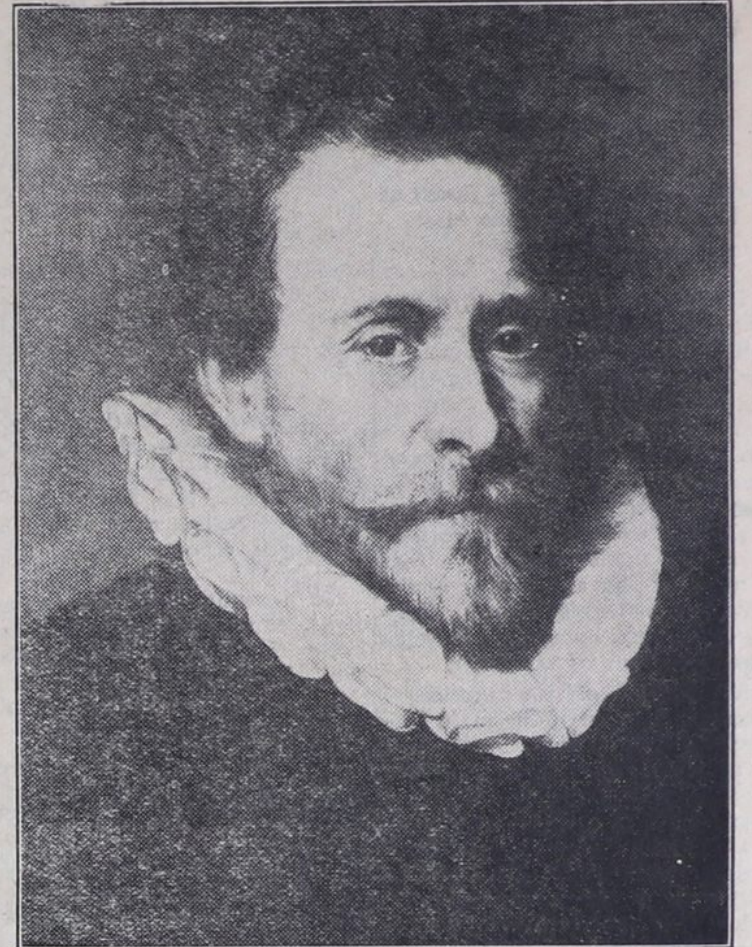
A Van Dyck Masterpiece Comes to Light