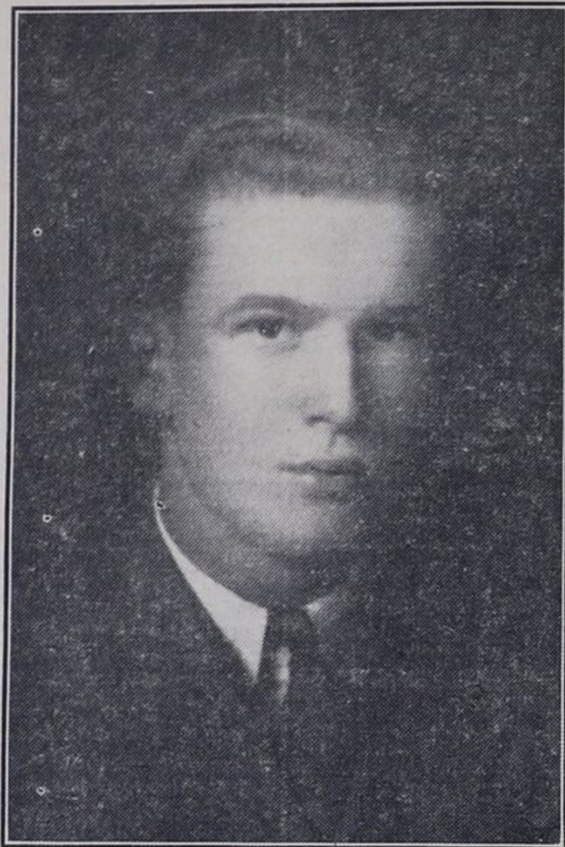
Haileybury boy who is a candidate from Temiskaming for Boys' Parliament