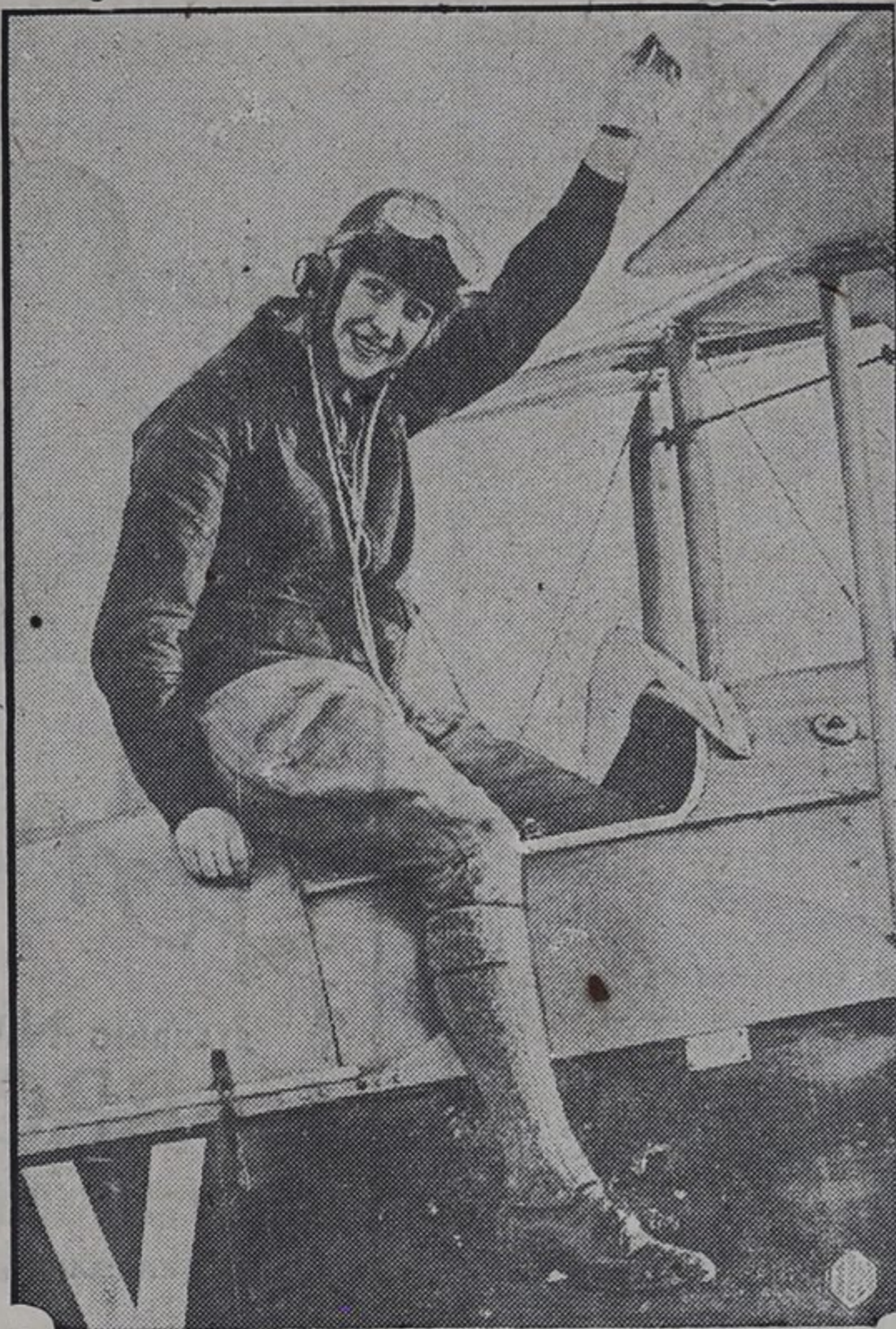
Miss Amy Johnson, 22-year-old aviatrix of England, who hopped off on her attempted solo flight to Australia, 10,000 miles away, last week. Miss Johnson is shown in the cockpit of her Gypsy Moth plane, in which she will try to beat the record of Bert Hinkler, of 16 days for the long trip.