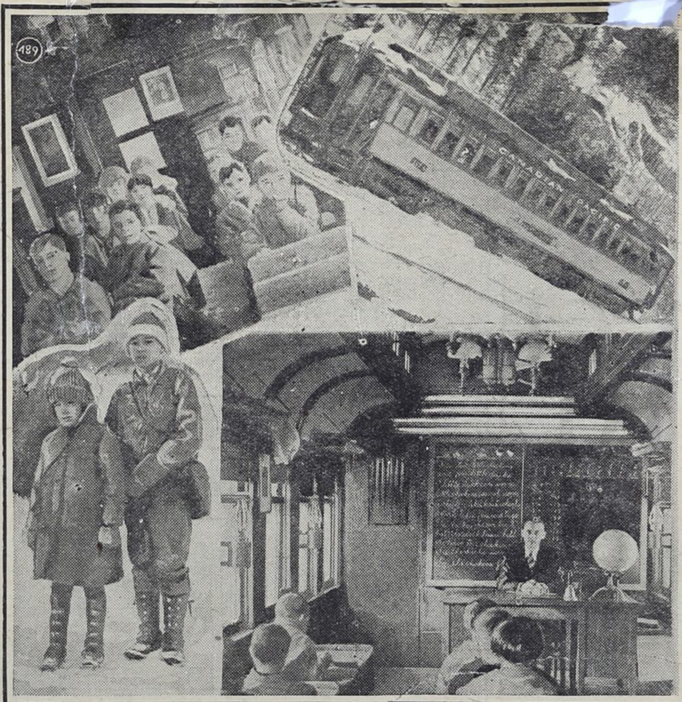
Providing schooling for children in the isolated sections of Northern Ontario long baffled the Ontario Department of Education. The little red school house—if it had been built—would have stood alone with no sign of human habitation for miles around or, if there had been a few houses near, the cost of upkeep would have been too heavy a burden on a few scattered families. So the Canadian Pacific Railway was called into consultation and the result is the travelling school car which has been operated during the winter months with increasing success for the past few years. Every child loves a train, but when that train comes especially to him and becomes his school—

well, you have to go to fairy tales to get the like of that. So they come enthusiastically from miles around, French-Canadians, Rumanian, Indian, Italian, English-Canadian—all races and ages from five to fifteen years of age. They come on snowshoes, skis, by dog team, from near and far. They get the three R's and they get acquainted among themselves. Difference of speech makes little difference to them and soon they are all using English. Children of pioneers, they are bright and adaptable. Lay-out shows exterior of car, interior with class. of boys and girls all set for lessons; another interior showing teacher and black board; and two typical school children on their way to the car.