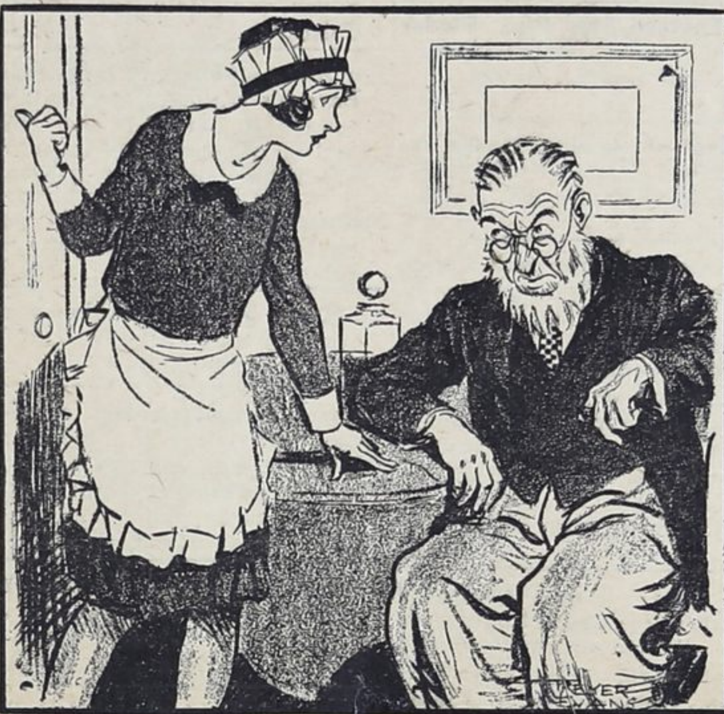
Terrified Maid: "Oh, Mr. McPherson, there's a man at the door who says he'll either commit suicide or murder if he doesn't receive some money!" McPherson: "Ask him which he means to do, an' if h e says murder, gi'e him this shillun'" —The Humorist