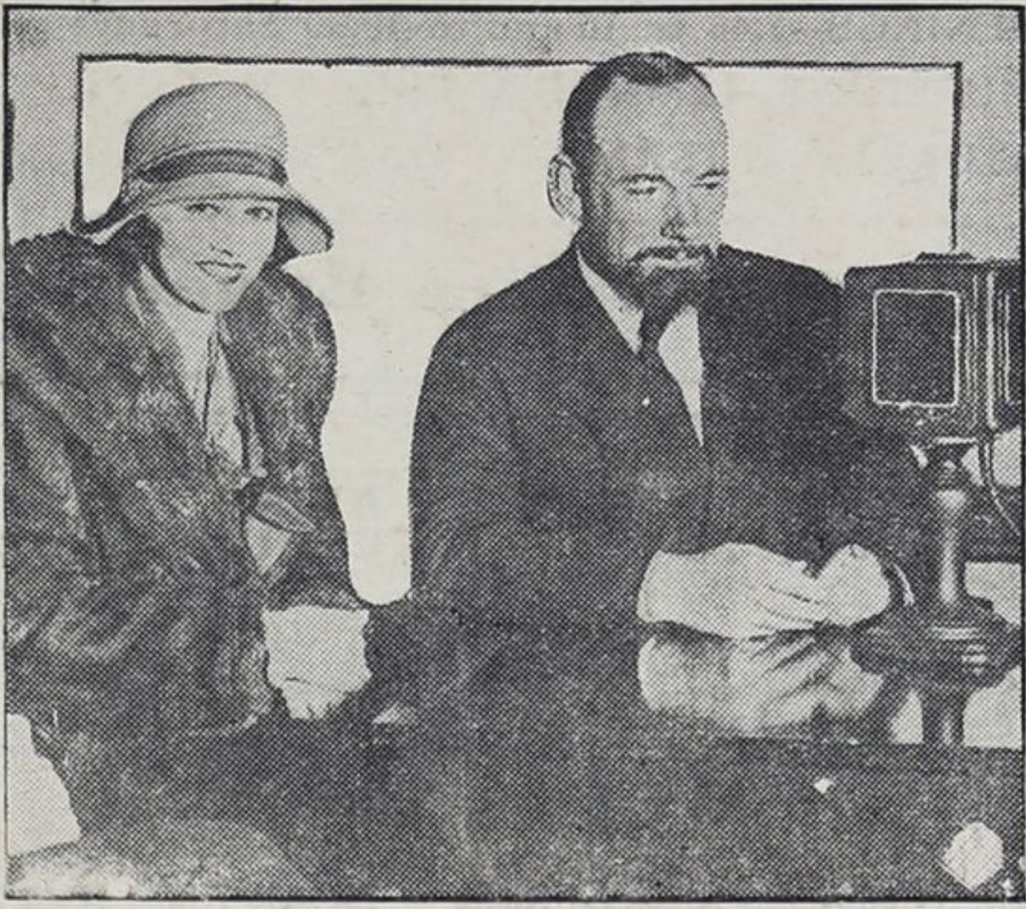
Lady Wilkins listening to Sir Hubert Wilkins broadcast to a large radio audience the perils encountered in the Polar regions by the second Hearst-Wilkins Antarctic expedition. He foresees the time when submarines as well as aeroplanes would aid explorers in finding and charting new lands.