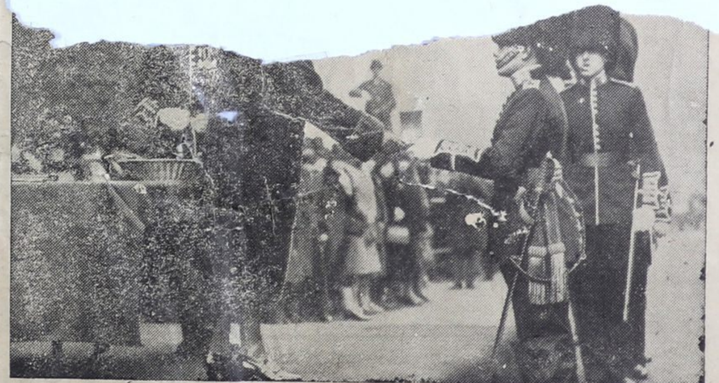
Above is Princess Mary presenting shamrocks to the officers of the Irish Guards who are stationed at the Tower of London, on Shamrock Day.