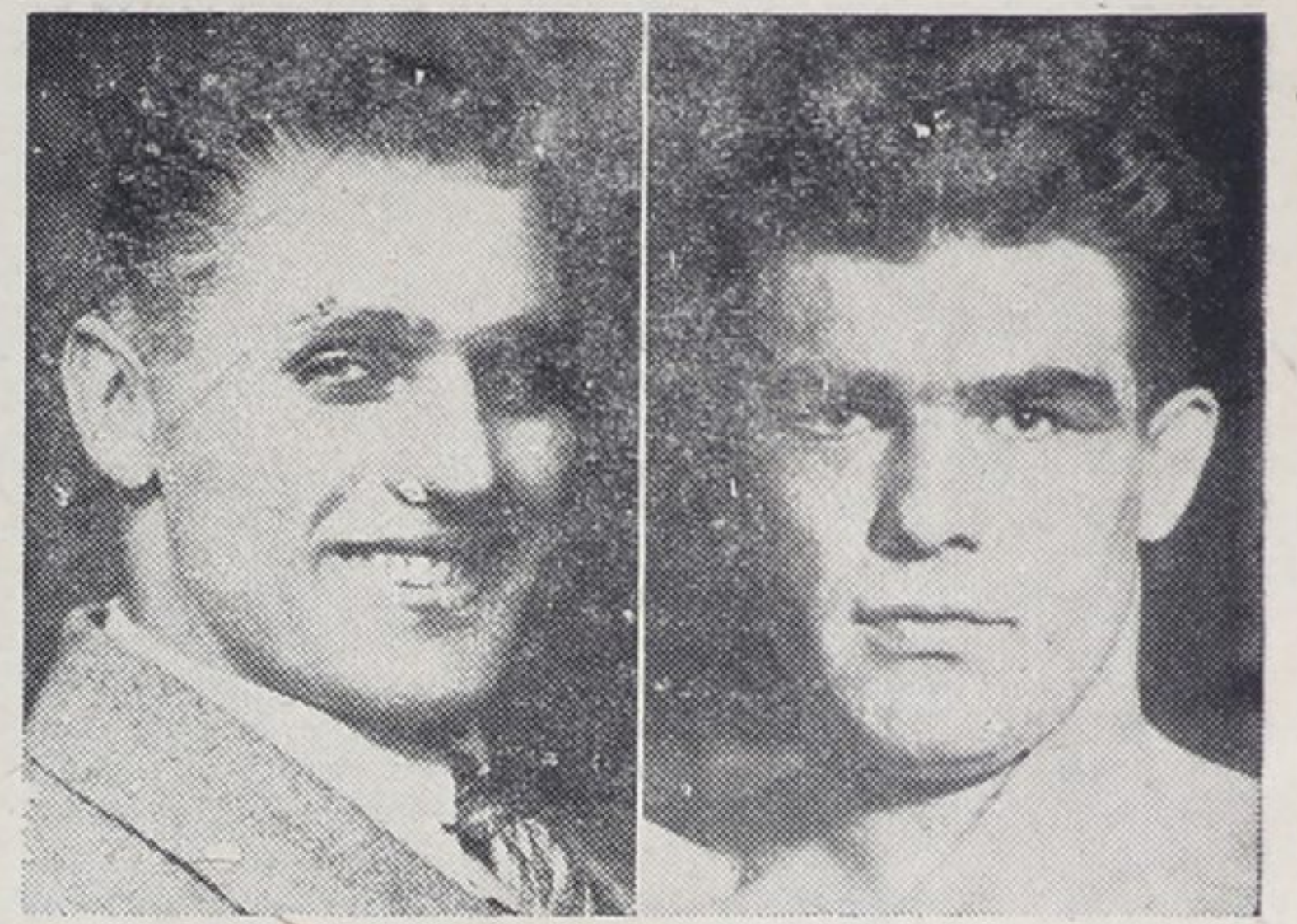
Phil Scott, the British heavyweight champion, who was defeated by Jack Sharkey at Miami, Florida, last month, has signed to fight Young Stribling, United States heavyweight, in London early in May. Above are pictures of the two fighters, Phil Scott (left) and Stribling (right)