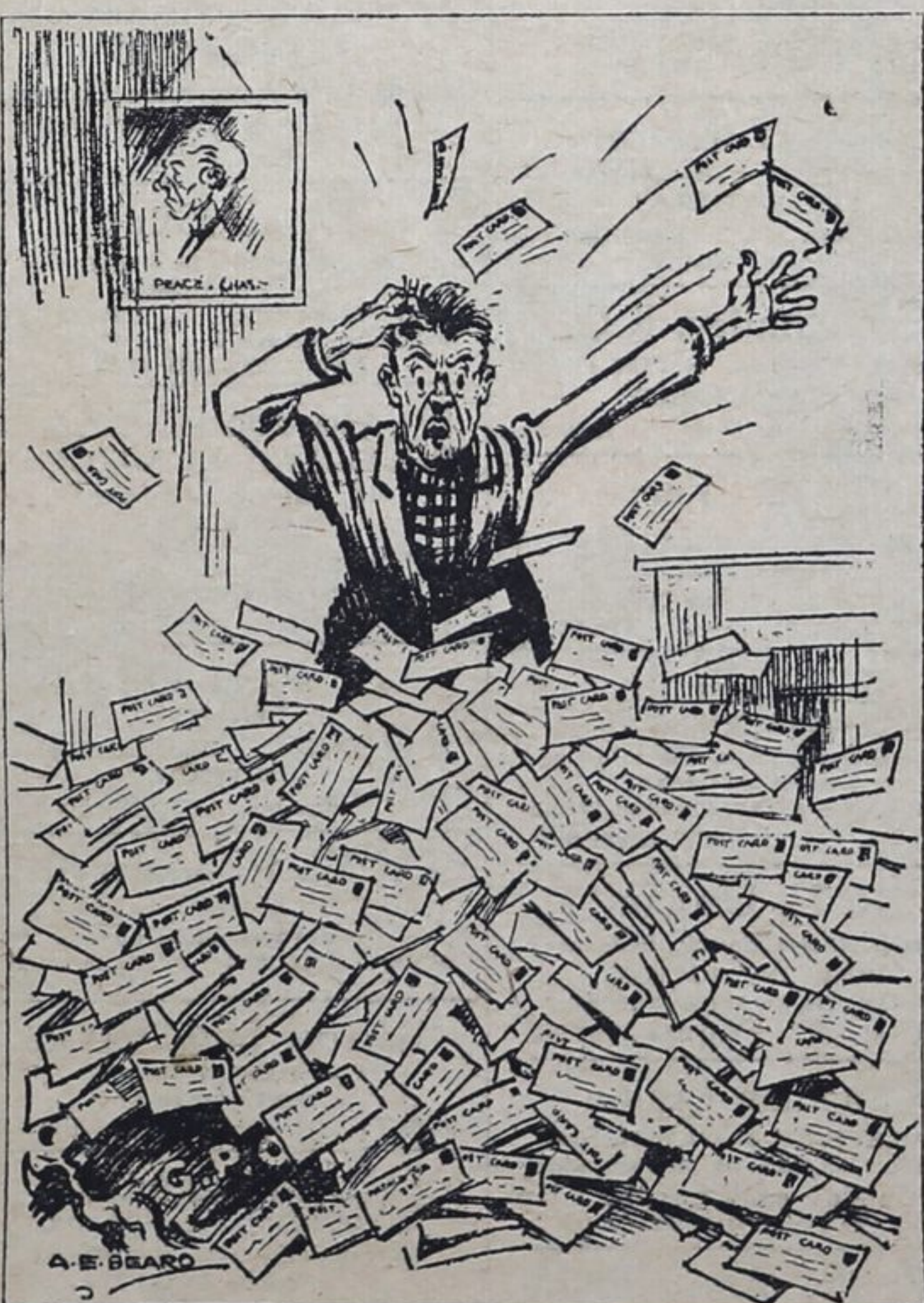
Nothing Doing, or the Mail Bag Robber who lifted one from Aberdeen. —The Humorist, London