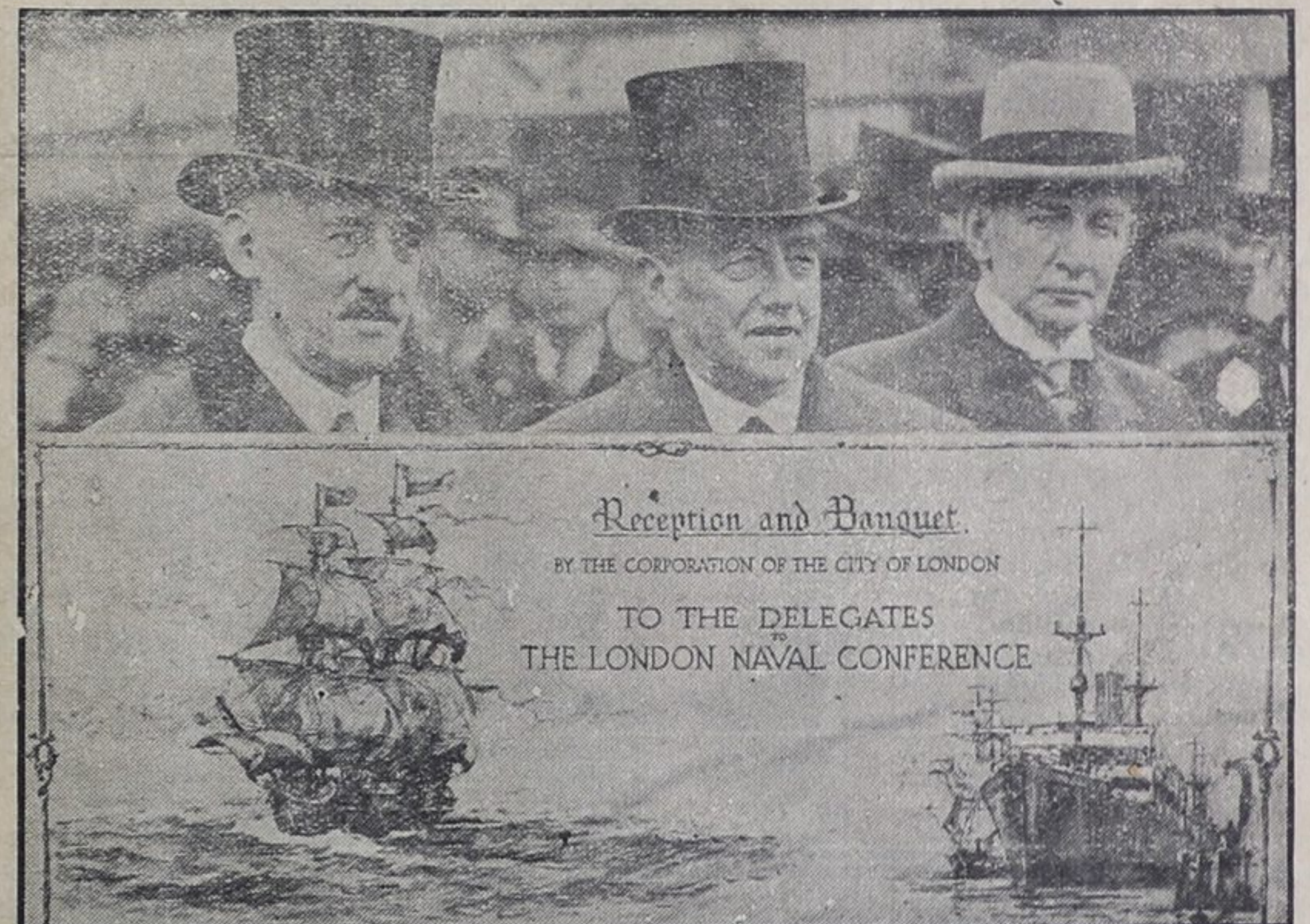
Above are Henry L. Stimson (left) chief United States delegate, Rt. Hon. Arthur Henderson (centre) British Secretary of State for Foreign Affairs, and General Charles Dawes, United States Ambassador to the Court of St. James, going to pay a visit to the British Prime Minister on the eve of the reception and banquet tendered the delegates by the City of London. Below is a reproduction of the beautiful invitation card sent out by the Corporation of the City of London for the reception and banquet to the Naval Power Delegates.