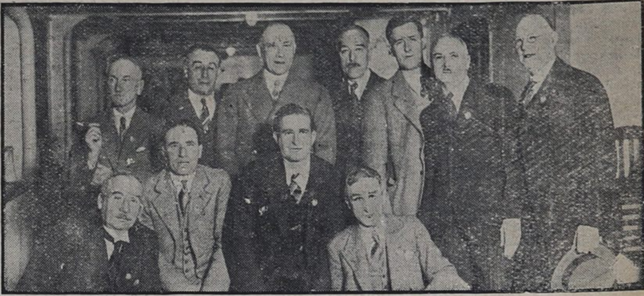
Members of the representative team of English, Scottish and Irish bowlers on their arrival at New York on their way to California to take part in the contest for the Charles J. Fox trophy. After the western contest, the team will play in tournaments in various United States and Canadian cities.