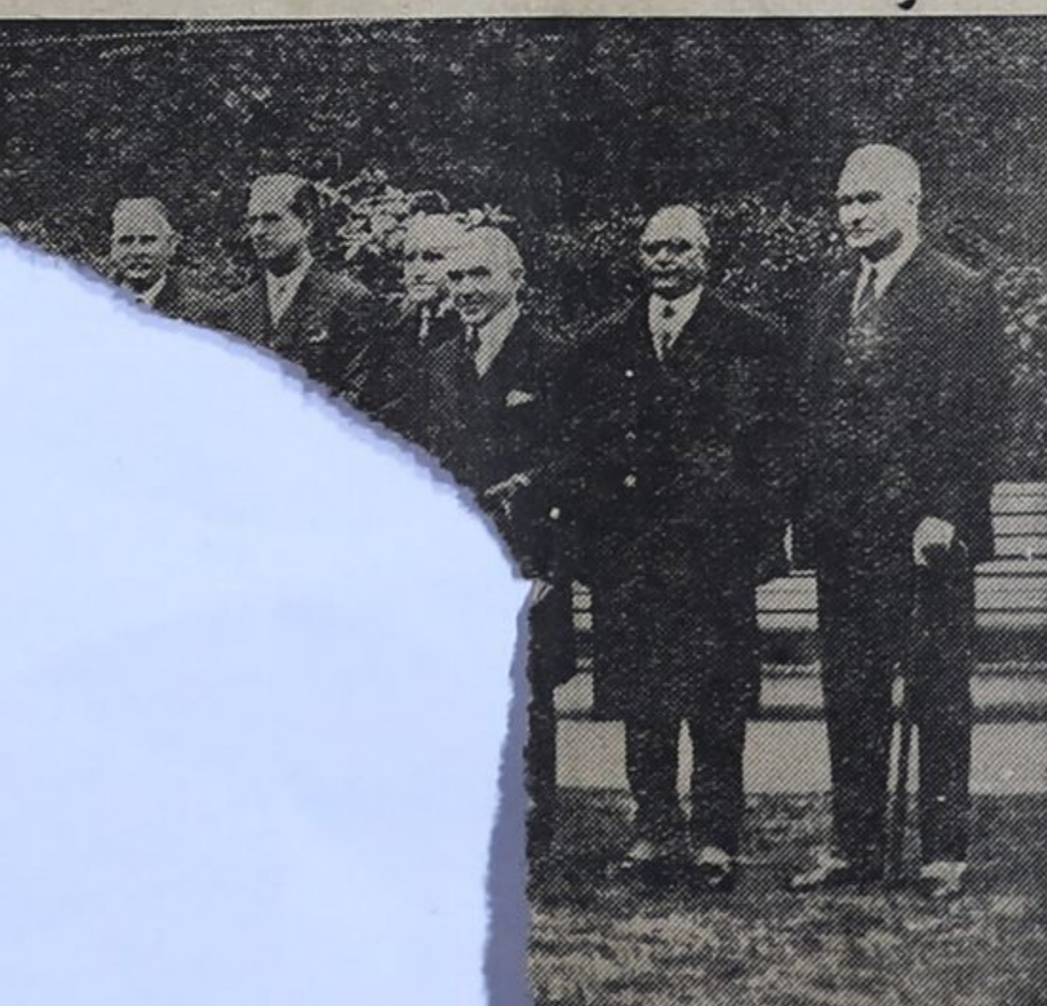
London met at No. 10 Downing Street, S. Grandi (Italy), Wakatsuki (France), Rt. Hon. Ramsay MacDonald (Canada),