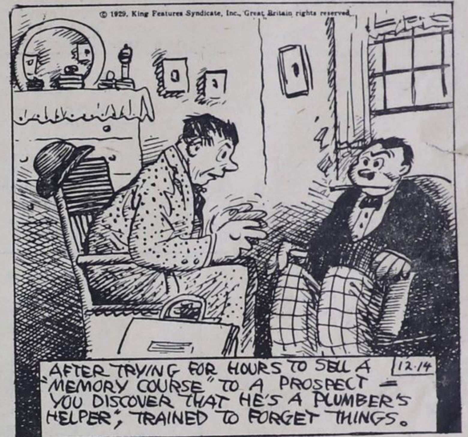
AFTER TRYING FOR HOURS TO SELL A MEMORY COURSE TO A PROSPECT YOU DISCOVER THAT HE'S A PLUMBER'S HELPER, TRAINED TO FORGET THINGS.