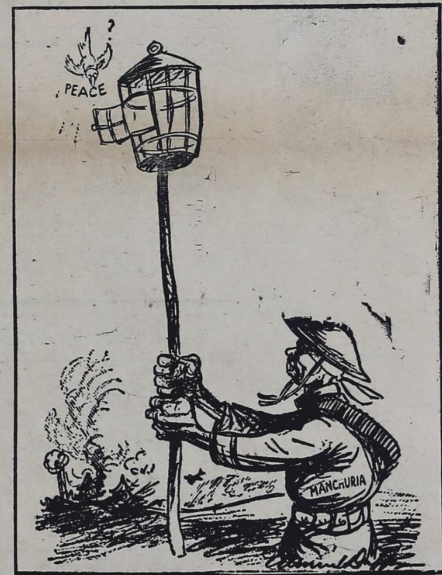
"COME, NICE BIRDIE, BACK TO YOUR CAGE" —Duffy in the Baltimore Sun