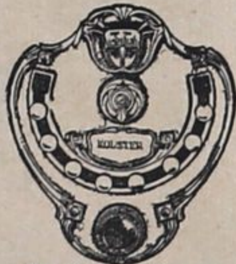
The Selector Tuner

With the Selector Tuner you simply press a button—turn the dial till it stops automatically, perfectly tuned to your pre-selected station. The set can also be tuned independently of the Selector Tuner.