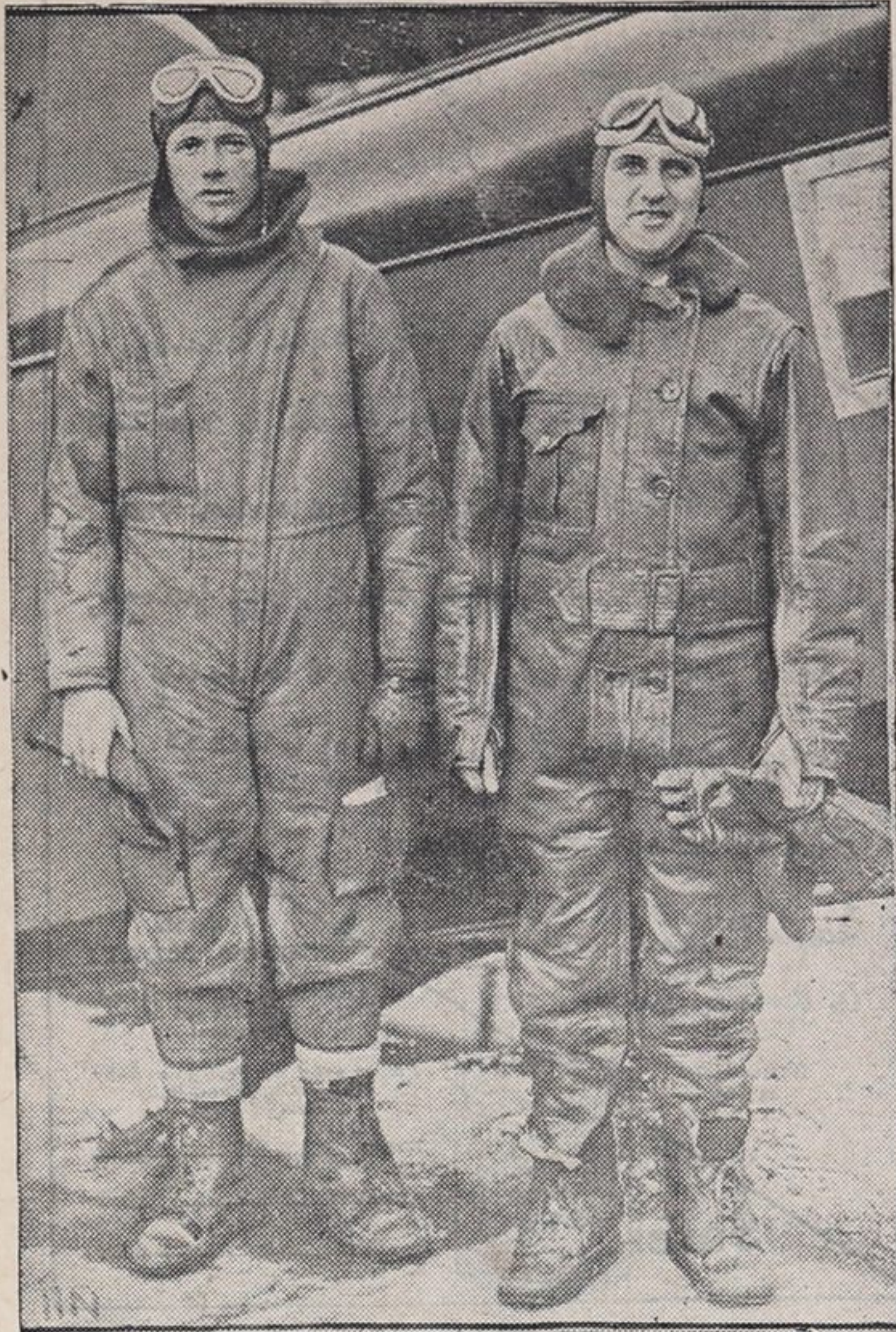
Colonel Lindbergh, the 'ambassador without portfolio' with Harry F. Guggenheim, newly appointed U. S. Ambassador to Cuba, who will have the distinction of being the first 'flying Diplomat' as he plans to make all his ambassadorial calls by airplane after he arrives in Havana next week.