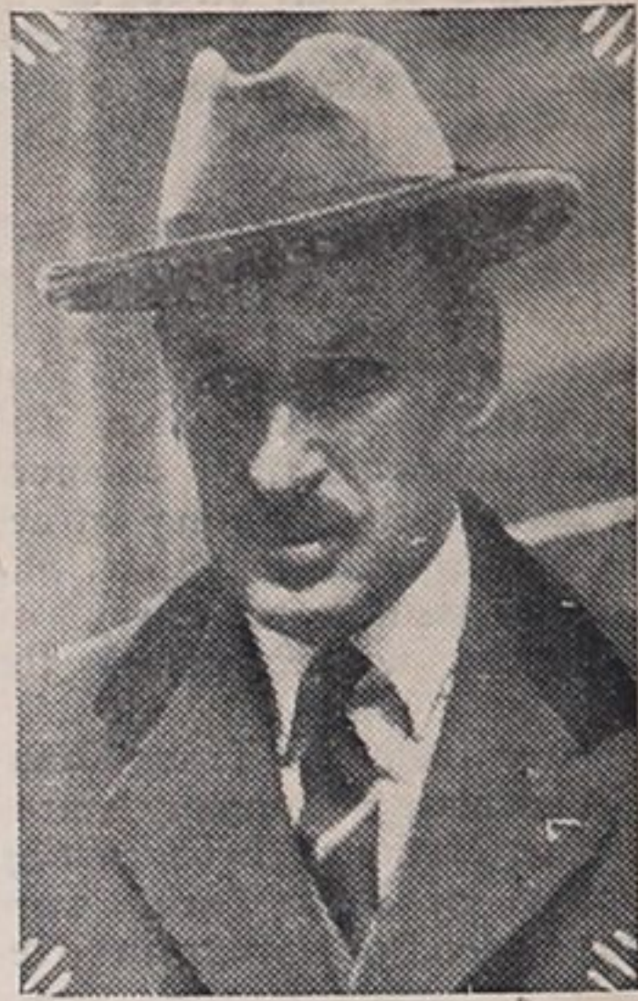
The Count, who was head of the People's Republic of Hungary in 1918, will visit the United States and Canada early next year on a lecture tour. He has been granted permission to enter the United States after a controversy with the State Department lasting four years