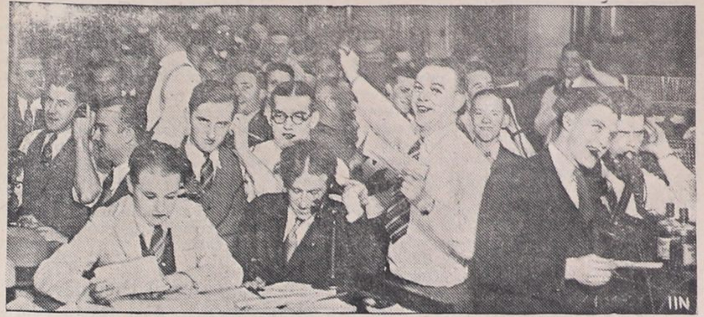
The five o'clock closing bell is only the beginning for these busy Wall Street clerks, who work long past midnight, computing gains and losses caused by the unprecedented activities in Wall Street. They do not seem downhearted on account of their arduous duties.