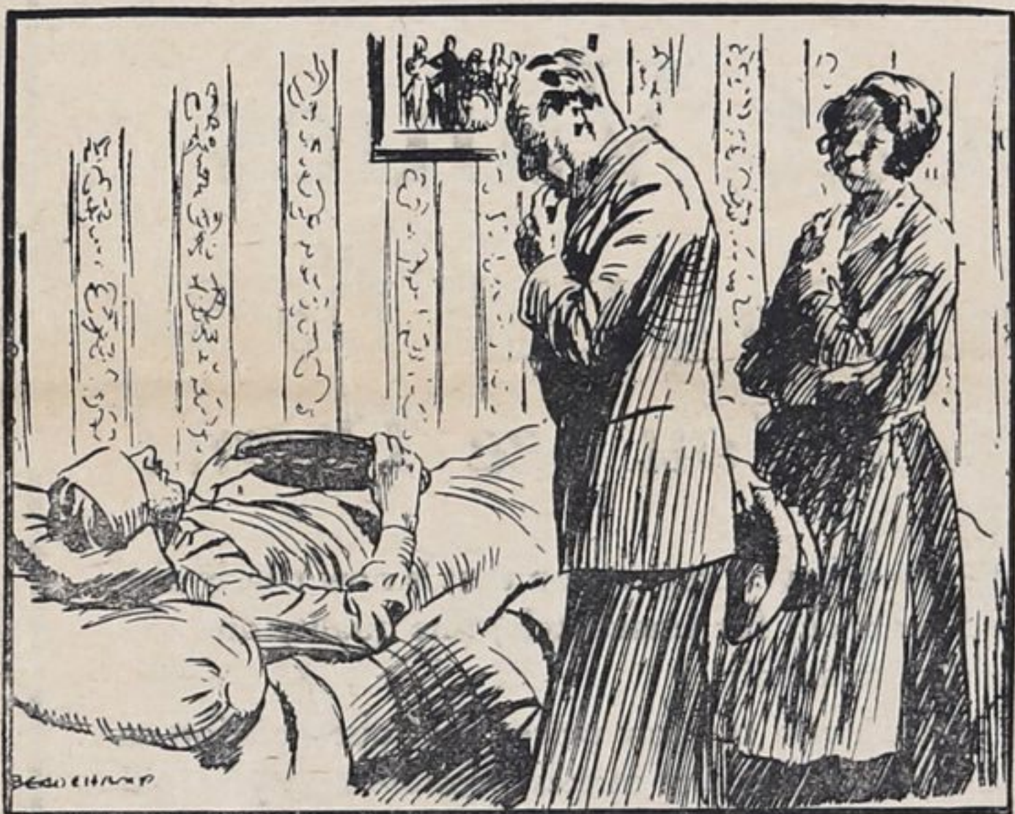
DOCTOR: "Why is he holding a steering wheel?" WIFE OF INJURED MAN: "He's a taxi driver and he can't sleep without it." —Passing Show, London