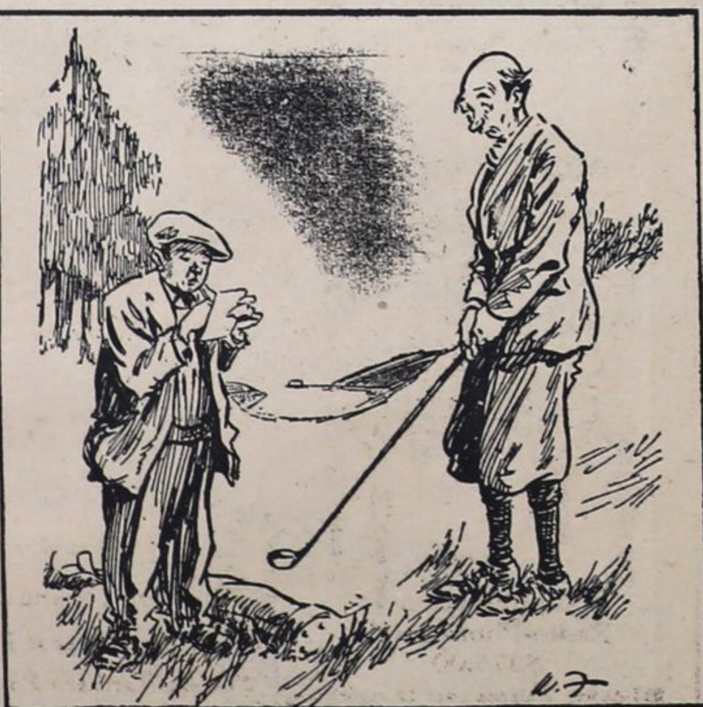
ADDIE (to beginner): "That makes you all square, sir. Fifty-three hits and fifty three misses!"

"Haileybury," he replied. "Which way are you heading?" he was asked, in order to forestall any possibility that the man might be on his way to his home town to vote. "Conservative, of course," he answered.