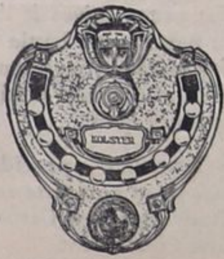
The Selector Tuner

Quicker, easier tuning—only Kolster has it. With the Selector Tuner, "hunting" for a station is a thing of the past. You simply press a button—turn the dial till it stops automatically, perfectly tuned to your pre-selected station. The set can also be tuned independently of the Selector Tuner.