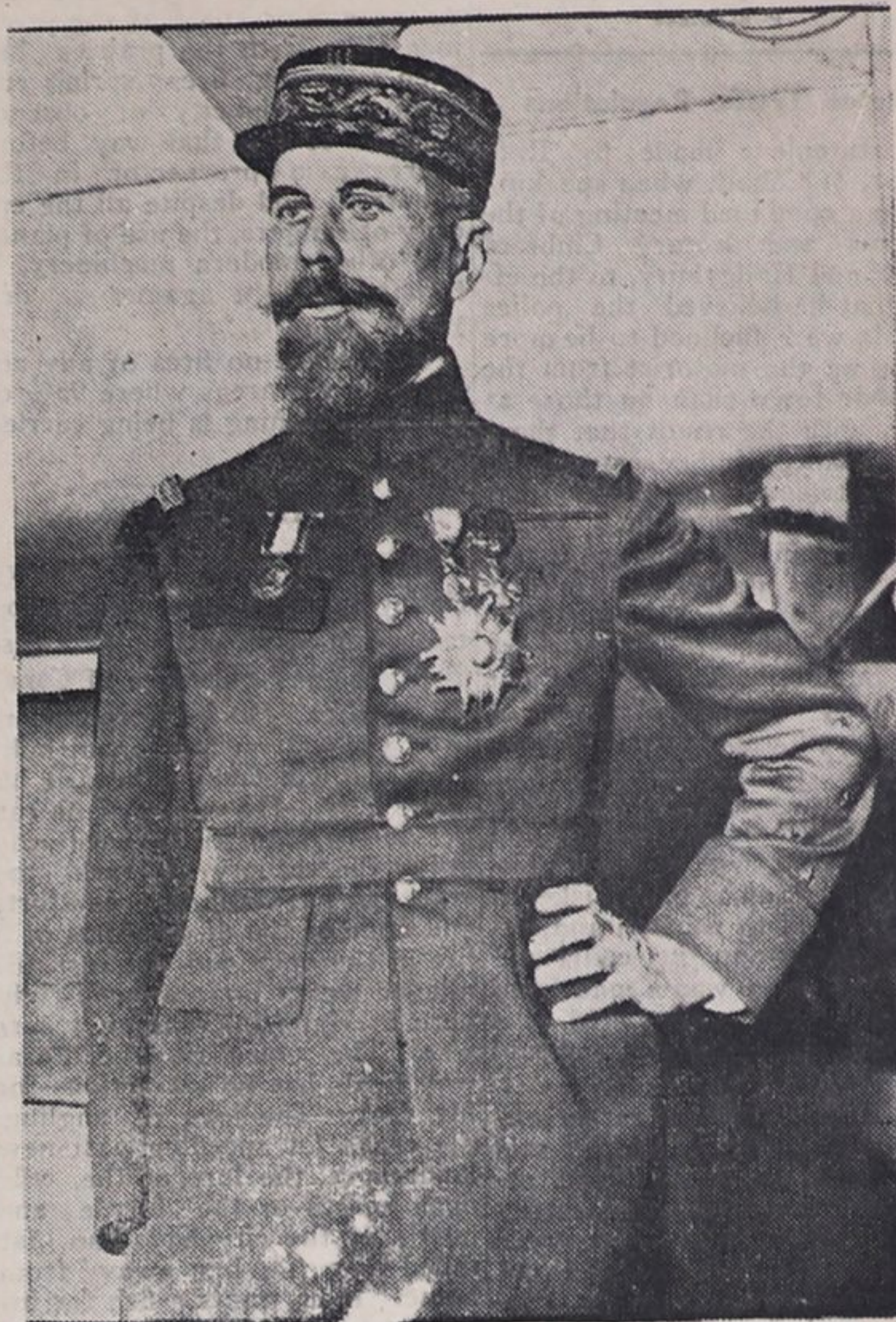
General Henry Joseph E. Gouraud, Military Governor of Paris, one of France's war heroes, who was enthusiastically greeted on his arrival at New York to be a guest of the Rainbow Division of the United States army, which saw service under the command of the one-armed French General.