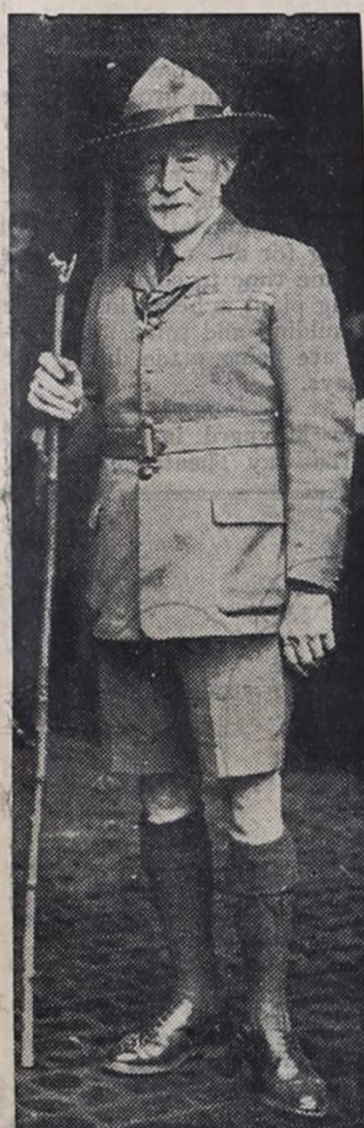
Baden-Powell, organizer and leader of the Boy Scout movement throughout the world, who has been made a baron by His Majesty on the occasion of the celebration of the twenty-first anniversary of the Boy Scout movement