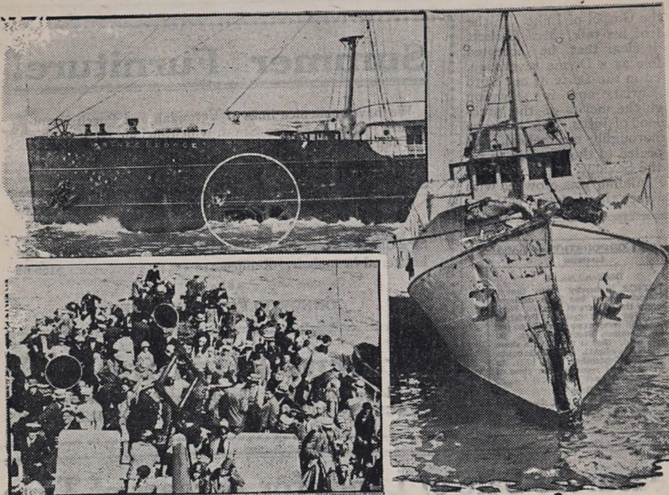
The coast liner Prince George is shown above limping into port at Boston after her crash fifty-five miles off shore in the early morning fog with the coastguard patrol boat Agassiz. Below are seen some of the 249 passengers who were rescued and safely ferried in small boats to the Agassiz and the cutter Mojave. The Agassiz is shown at right, with stove-in bow, at the Charleston Navy Yard, after the collision.