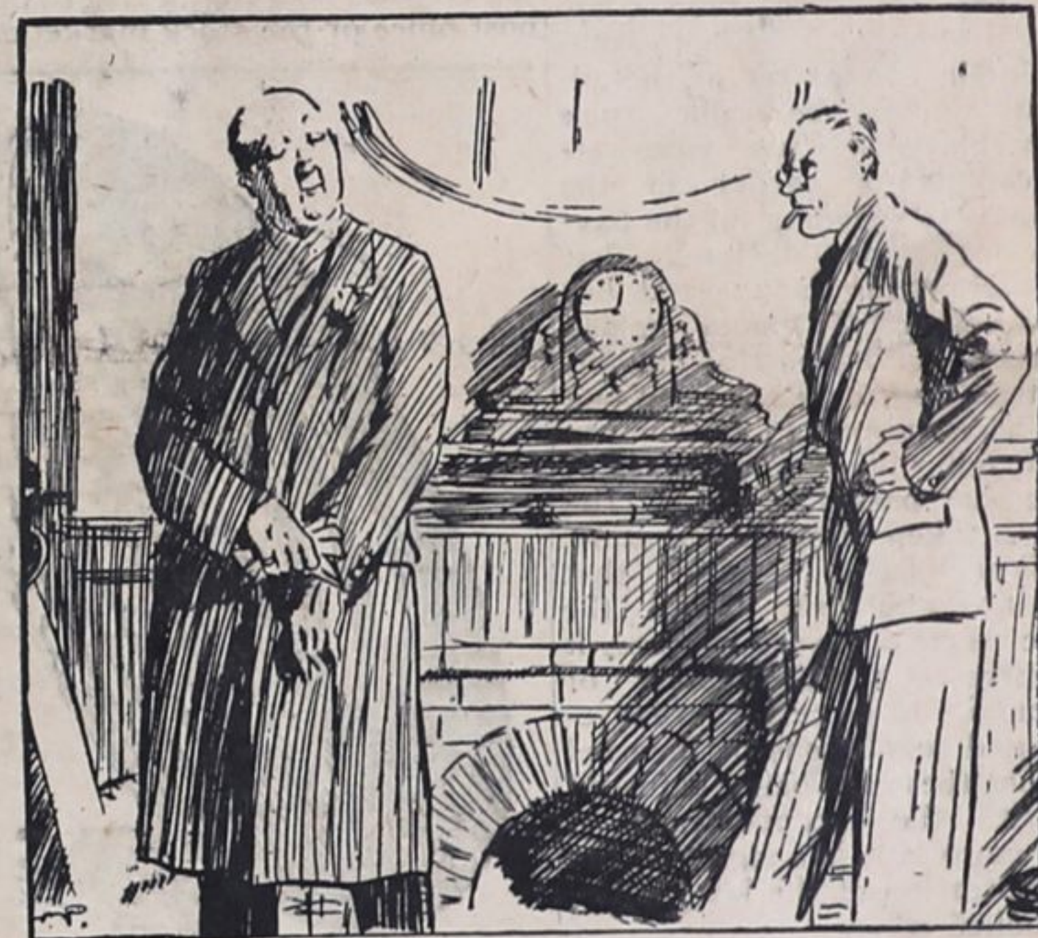
George: "Do you believe in clubs for women?" Earl: "Yes, if kindness fails."