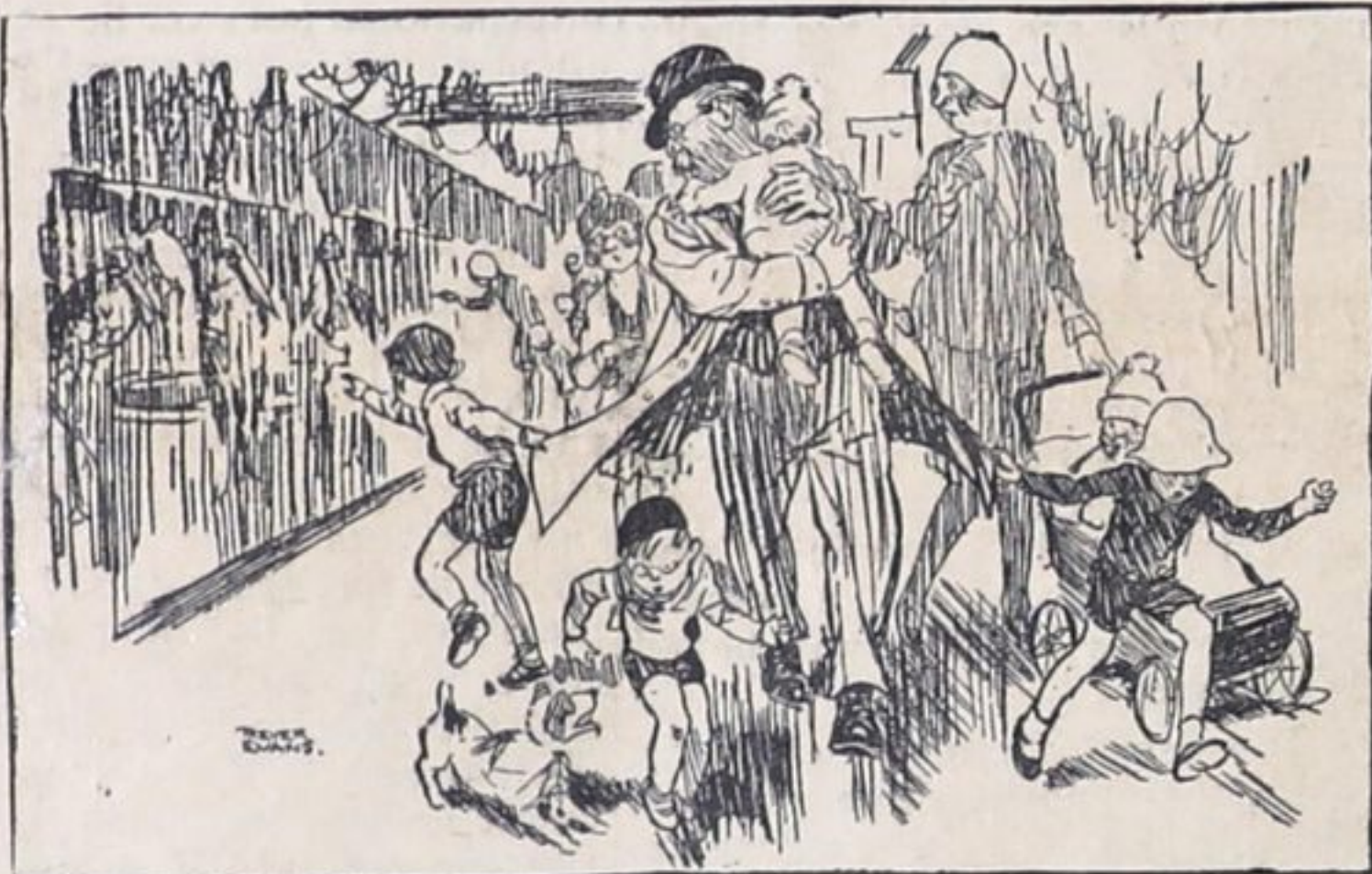
AT THE ZOO

12 Hours : 150 miles : Return Fare, $6.00