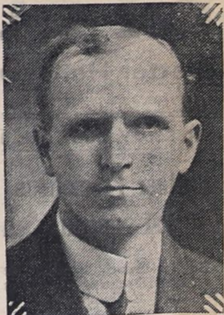
Hon. W. D. Euler, Minister of National Revenue for Canada, who sails for the Old Country next month on national business.