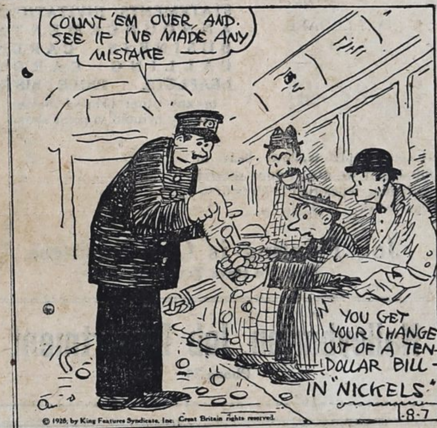
© 1928, by King Features Syndicate, Inc. Great Britain rights reserved.