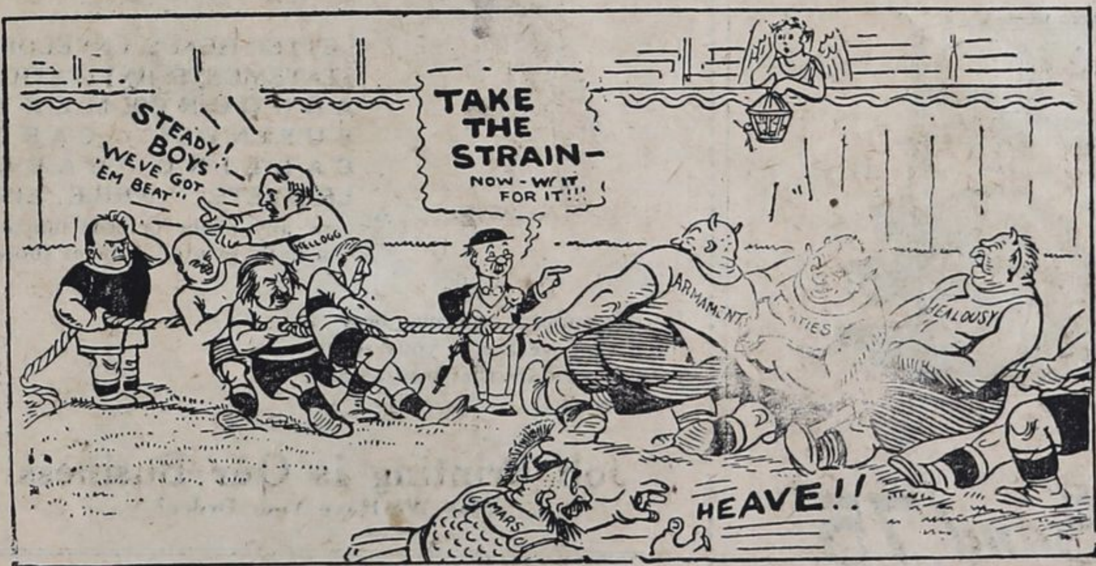
THE INTERNATIONAL POLITICAL OLYMPIC GAMES — No. 1: "The Tug o' Peace" —Daily Express, London.

Canada Northern Power Corporation Limited Cobalt Haileybury New Liskeard Englehart Kirkland Lake Rouyn Noranda Timmins South Porcupine