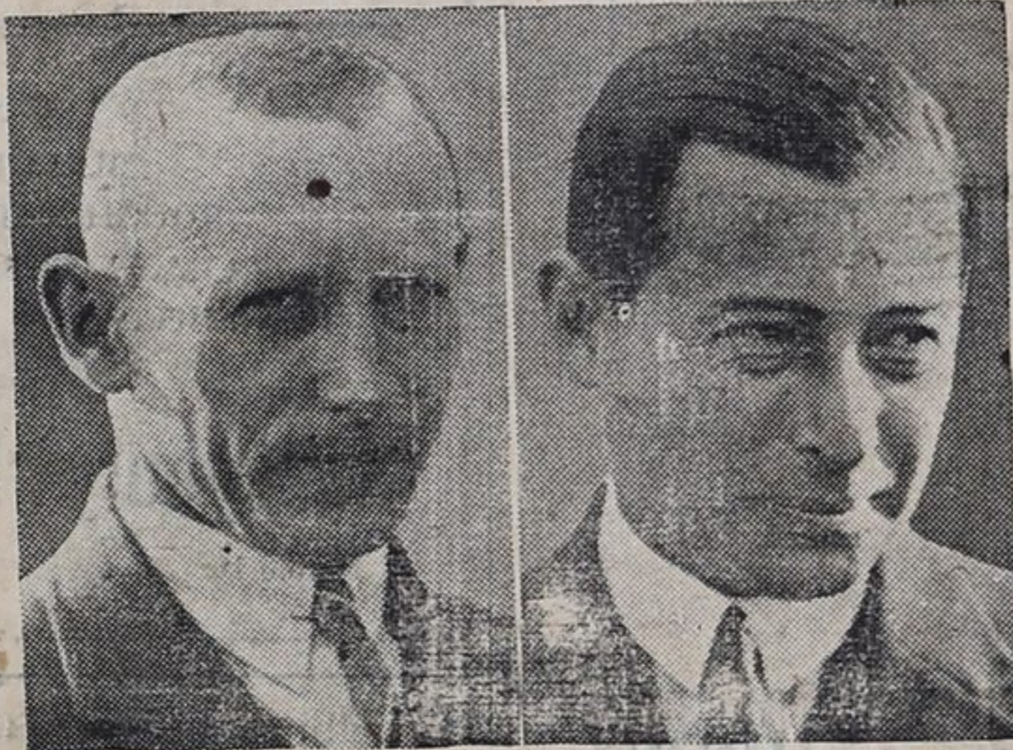
POLISH FLIERS COME TO GRIEF

Left to right, are Major Kubala and Major Idzikowski, of Poland who were rescued at sea off Portugal, when their plane crashed in the early stages of what they hoped to be a non-stop east-to-west flight across the Atlantic.