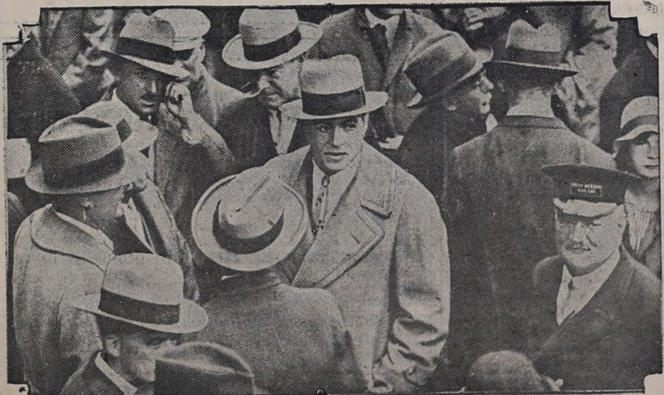
FORMER HEAVYWEIGHT CHAMPION ARRIVES IN ENGLAND

The above photograph shows Gene Tunney, ex-heavyweight king, surrounded by fellow passengers, just before the globe-trotting fighter landed at Plymouth, England, for a visit to London and Ireland preliminary to his walking tour of Europe. Gene appears to enjoy the attentions of his new friends.