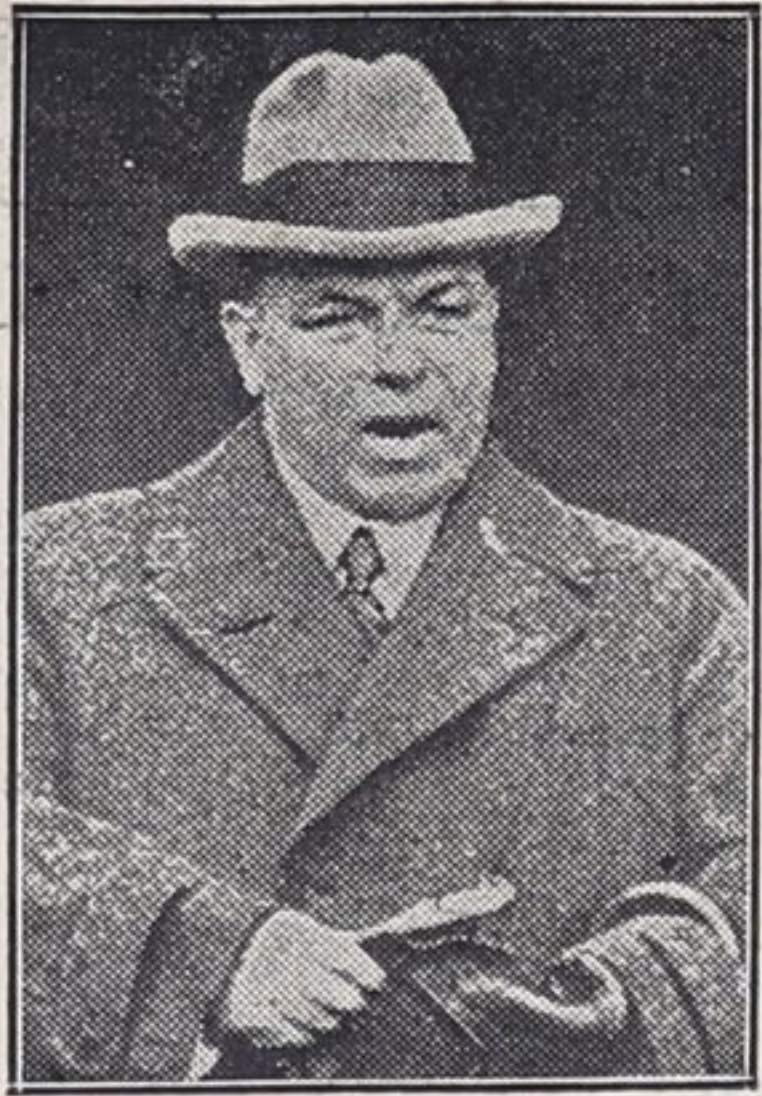
Rt. Hon. W. L. McKenzie King Prime Minister of Canada, who has been elected Vice-President of the League of Nations Council. He is now in Geneva, where he signed the Peace Pact on behalf of this country.