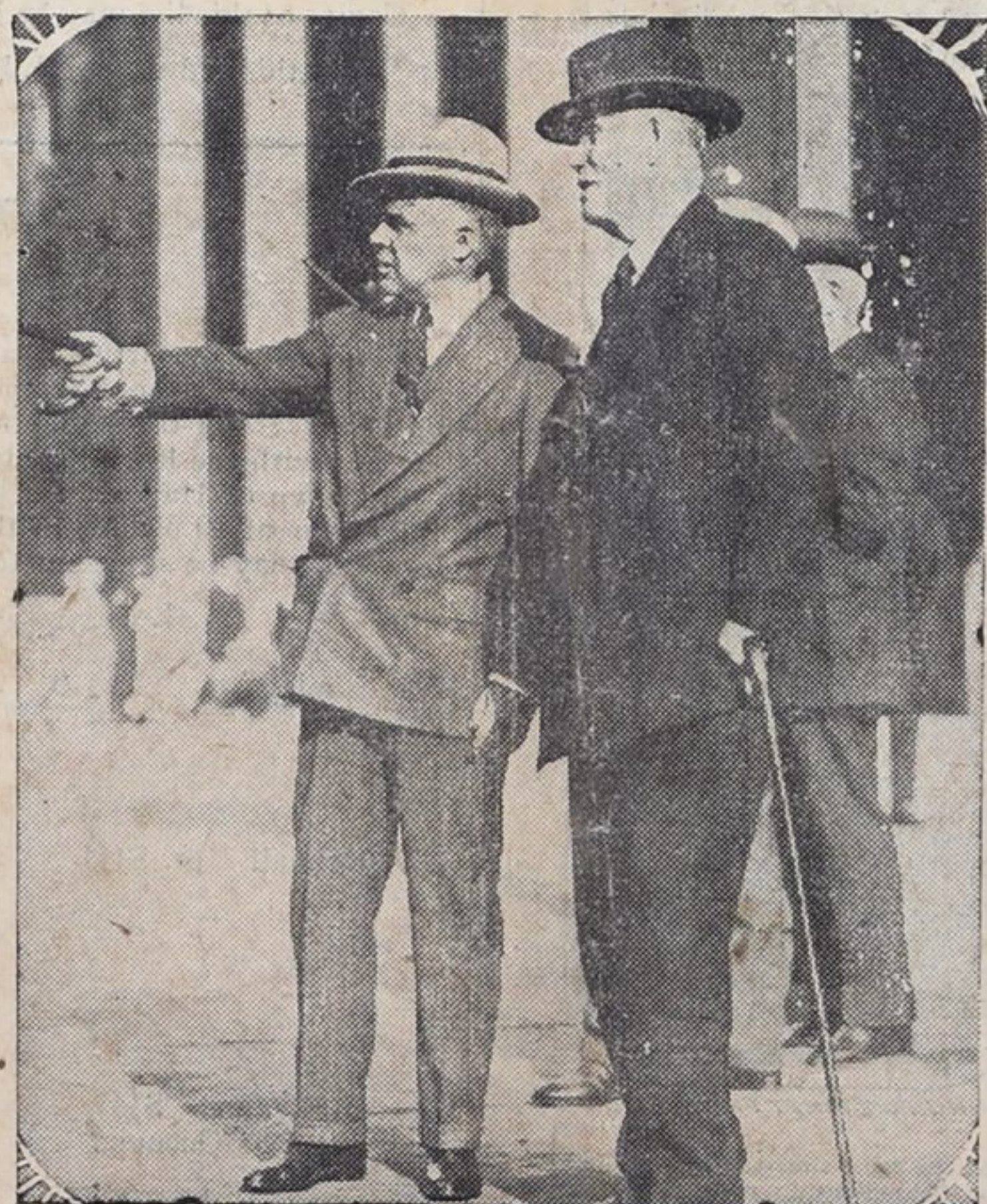
Sir Herbert Holt Views Toronto's New Hotel Skyscraper E. W. Beatty, President of the Canadian Pacific Railway, is seen here in front of the Royal York Hotel, pointing out to Sir Herbert Holt, President of the Royal Bank of Canada, the salient architectural features of the new building