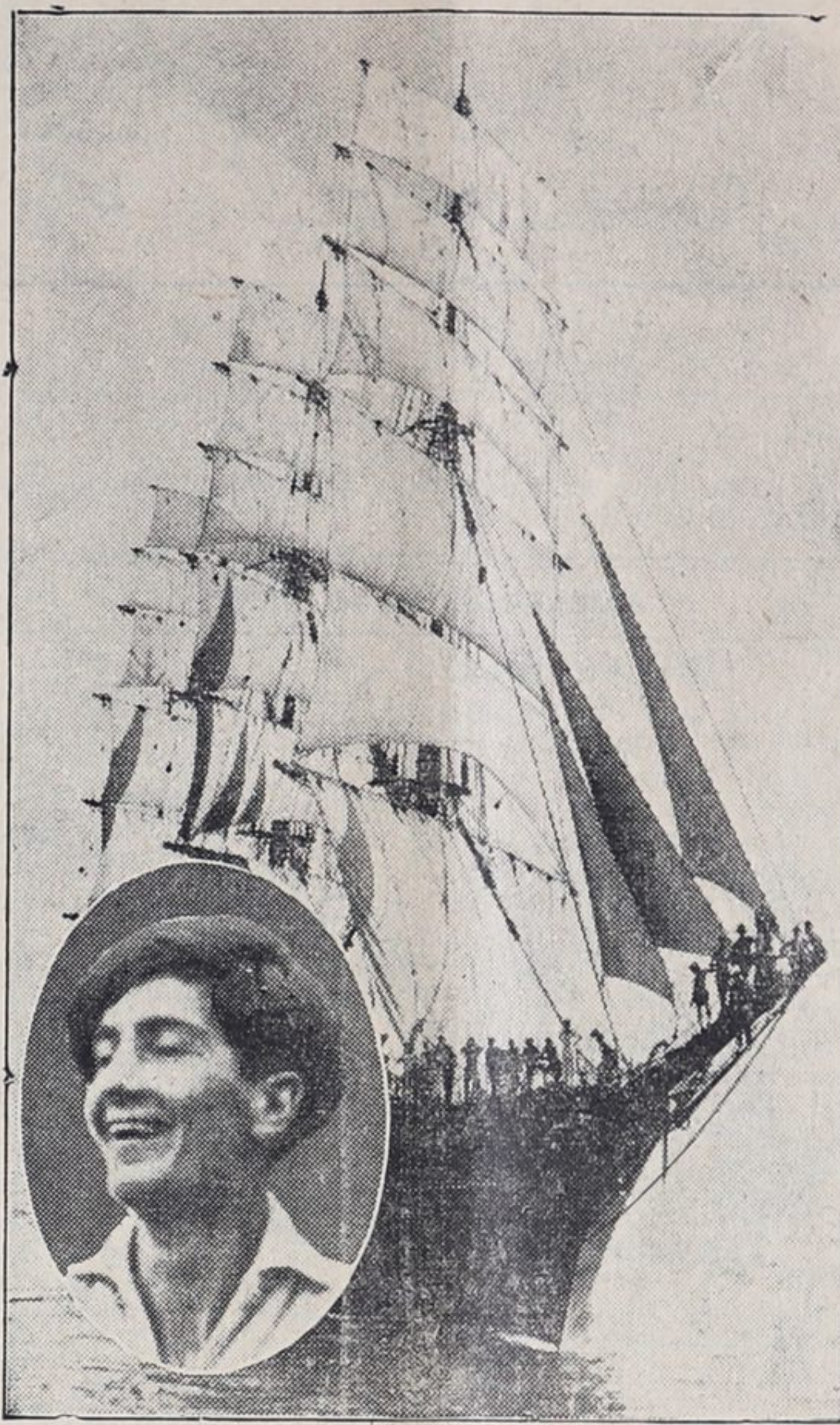
Girl Artist is Stowaway on Picturesque Barque.