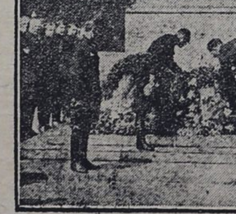
The Don Cossack choir of Russian officers gather at the Cenotaph in London to lay a wreath in token of their respect and friendship, unbroken in death.

PENROSE. Racial Origin—Welsh. Source—Geographical.