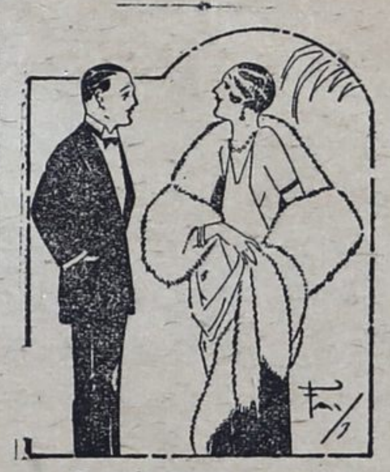
Practice Makes Perfect.

Ships at sea have a "language" of their own when they wish to converse with or signal to one another. Nearly all steamers carry a wireless installation, but, in addition, every vessel of this type is provided with a steam whistle or siren, a mechanically operated fog-horn, and a bell. Sailing ships are obliged to have both a mechanical fog-horn and a bell before they are allowed to enter or leave a port.