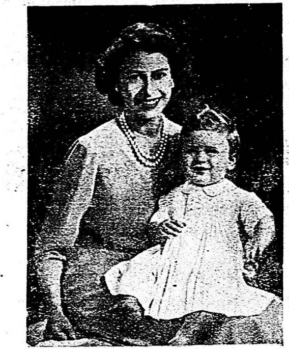
PRINCESS ELIZABETH AND PRINCE CHARLES —A new portrait of Her Highness Princess Elizabeth, Duchess of Edinburgh, with her infant son, Prince Charles, who was one year old on November 14, 1949. At 11½ months, the Prince weighed 24½ pounds, had six teeth, and was tall for his age.