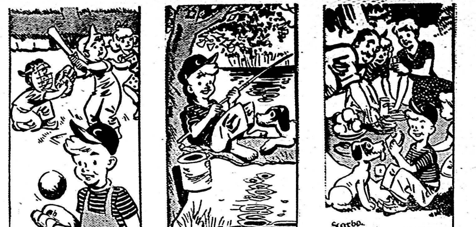
Let's be honest, kids, let's face it: Summer hasn't been hot. Fishing, swimming, boating, loafing. Picnics, baseball—all that rot.