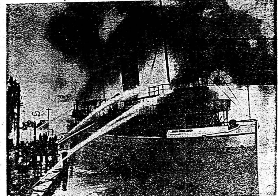
All Ashore—Fire sweeps the passenger steamer Northumberland, berthed at Port Dalhousie, Ontario, as it was about to start its 39th year on Lake Ontario.