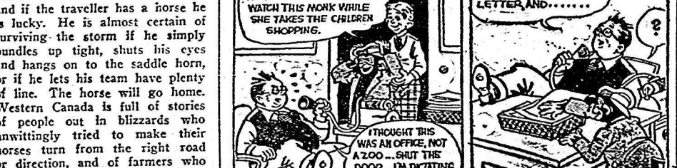
"Wilfred has been coming home like this every day since we got the new deep-freeze