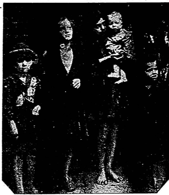
"Give Them This Day . . ."—Five out of 3,500,000: Four of these ragged youngsters are the children of a War Widow; the fifth (left) is a neighbor in their bombed-out Budapest slum. They typify the millions the United Nations' International Children's Emergency Fund is trying to help feed.

The bird design—most popular new idea for chair-sets! Make these graceful bluebirds in easy pineapple design crochets—they're so smart! Bluebird chair set—a graceful touch for any room. Pattern 656 has crocheted directions for set. Send TWENTY-FIVE CENTS in coins (stamps cannot be accepted) for this pattern to the Needlecraft Dept., Room 421, 73 Adelaide St. West, Toronto. Print plainly PATTERN NUMBER, your NAME AND ADDRESS.