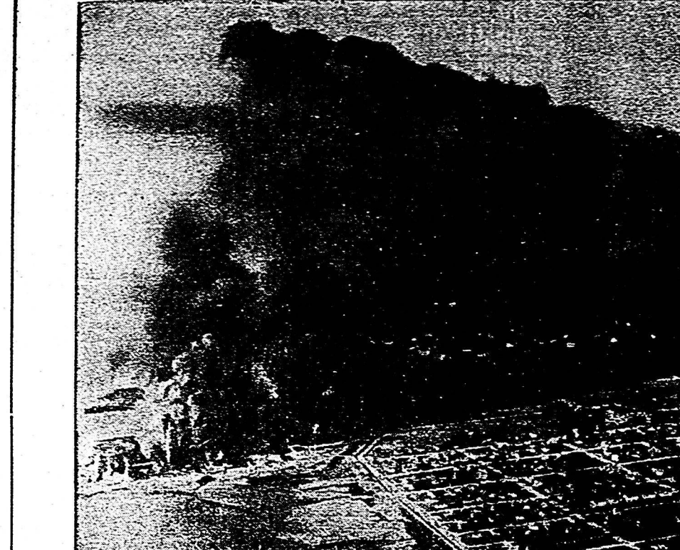
The blast-smashed town of Texas City lies in the foreground at right. Monsanto Chemical's once gleaming styrene towers and the neat corner of its 30-acre plant are at left, a mass of fire-blackened debris under the smoke of the still burning area on the second day after the Texas City disaster.

When the French Linc freighter Grandcamp put into Texas City, on Galveston Bay, crew members began loading her with ammonium nitrate, badly needed for fertilizer in France.