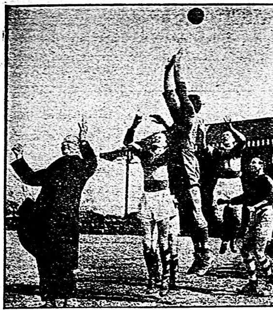
Bernard Cardinal Griffin, Roman Catholic Archbishop of Westminster, throws the ball into play at the Gaelic soccer match between the Irish teams Cavan and Kerry near London.