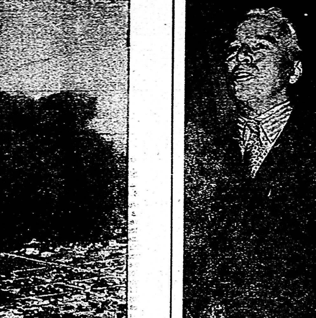
Screen comedian Charles Chaplin is in serious mood as he vehemently answers questions of news-magazines concerning his alleged leftist leanings and failure to become an American citizen.

Communism: World Conquest Odd the woody arguments that are being made against the United States barring Communists from government departments, comments the Ottawa Journal.