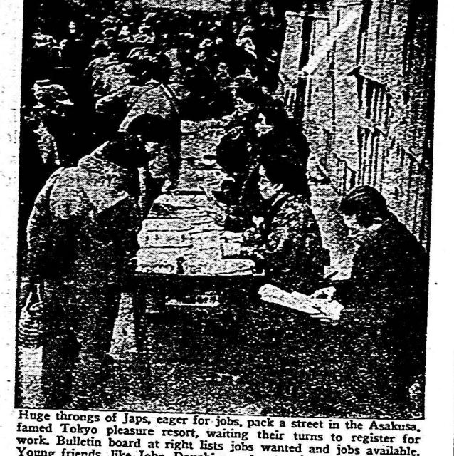
Huge throngs of Japs, eager for jobs, pack a street in the Asakusa, Tokyo, Japan. The picture was taken at a time when the Government was trying to get the new taxes into effect on announcement. The average Briton found that he could afford even less comfort than before.