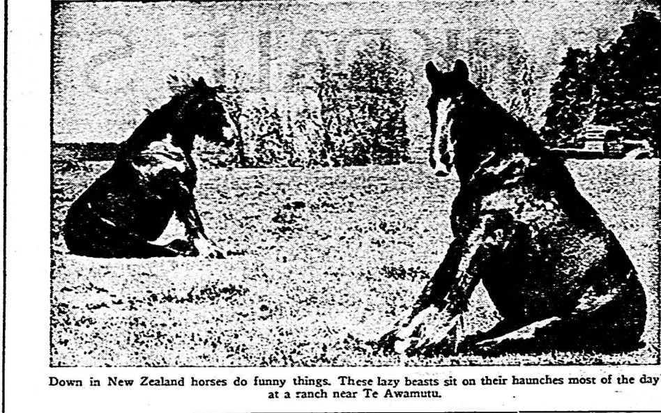
Down in New Zealand horses do funny things. These hay beasts sit on their haunches most of the day in a ranch near Awamutu.