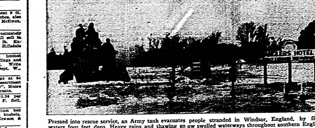
Pressed into rescue service, an Army tank evacuates people stranded in Windsor, England, by flood waters four feet deep. Heavy rains and thawing on well swelled waterways throughout southern England.