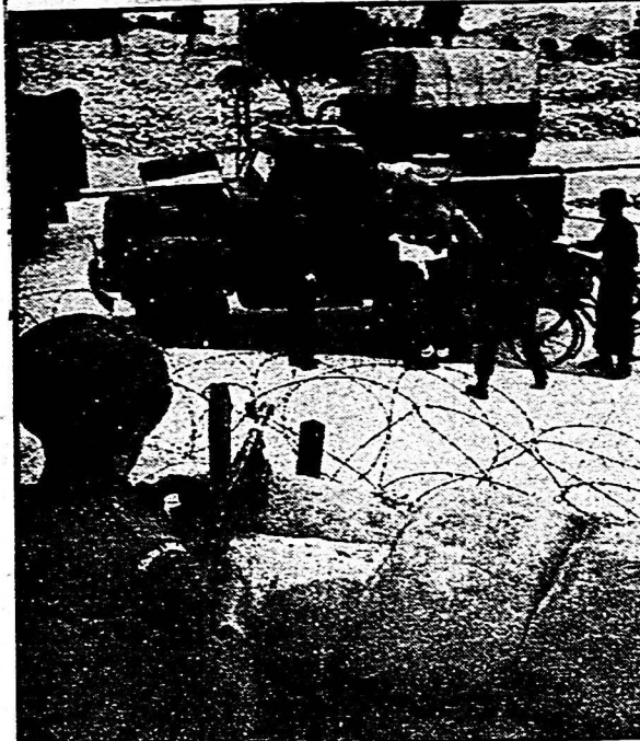
From behind a sandbag barricade a British gunner watches Tommies to enter a guarded zone of Jerusalem...