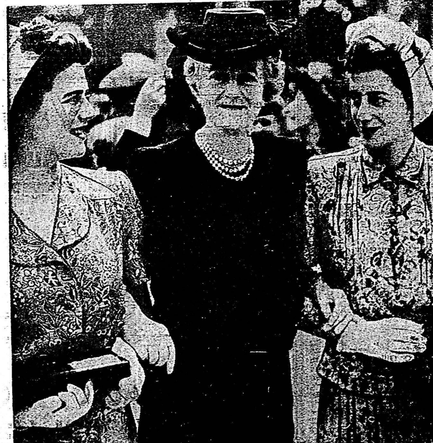
Honored for her work in connection with British aid for Russia, Mrs. Winston Churchill, with her two daughters, Mary, left, and Sarah, right, leaves Buckingham Palace...