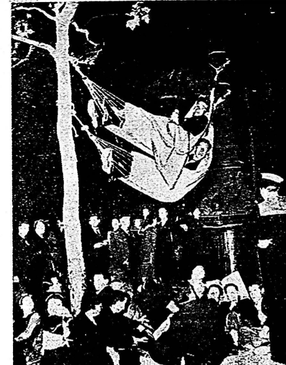
Farsighted sailors brought their hammocks with them during victory celebration in London. Here the men sleep in them between the trees and a lamp post in anticipation of a good night's rest, while others sleep on the ground. Visitors from all parts of the world flooded the city, causing road shortages.