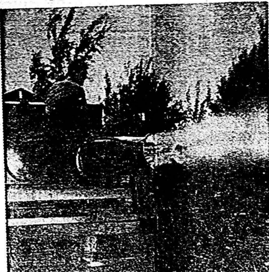
A new spraying device, effective in 200-foot radius, gets first test as Hal Biltzard unleashes spray oil, water and dust into bag breeding section of Miami.