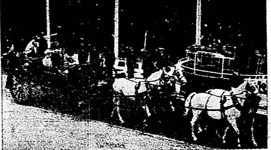
Arriving in the state landau at the reviewing stand in The Mall, London, as representatives from all corners of the world parade to celebrate victory...