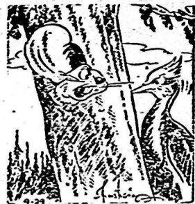
"Hey! Watch what you're doing with that thing!"

IT REALLY IS SMART to serve Maxwell House. This famous blend of coffees has extra fragrance and flavor — extra smooth, full body. It's always "Good to the Last Drop!"