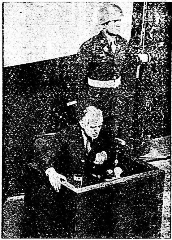
"Lied," admits Joachim Von Ribbentrop, former German Foreign Minister, during cross examination at Nuernberg war criminal trials. Sir David Maxwell Fyfe, chief British Prosecutor, forced Ribbentrop to admit he had told falsehoods during his handling of Nazi foreign affairs before the war.