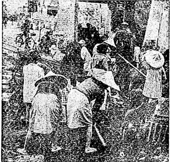
Children of Taihoku, Formosa, labor with picks and shovels in the ruined city's streets, removing and salvaging wartime wreckage.

Liberated after 51 years of Japanese rule, Formosans today are not sure whether bondage to the Jap was not preferable to the "freedom" of their last six months, under Chinese rule. Famine, widespread unemployment, black markets and economic robbery impose heavy burdens. These exclusive pictures, showing young children toiling to make their meager living, were taken by Harlow Church, NEA-Acme correspondent, first Occidental photographer to visit Formosa since 1936.