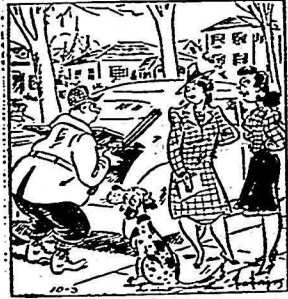
"Oh, he goes out an' goes through the motions—then we eat eggs!"