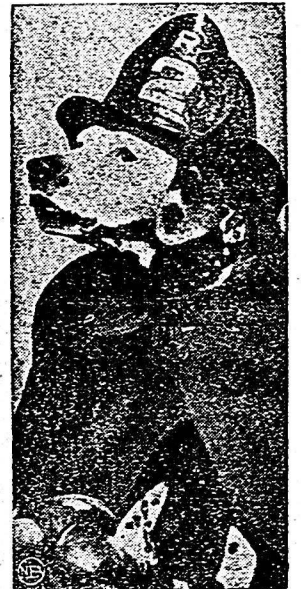
Even freezing weather can't keep Neddo back at the firehouse when men of Rescue Co. No. 2, Boston, Mass., answer a call. Above, warm in a fireman's coat and hat, he sits atop the truck and watches intently as his masters battle a blaze.