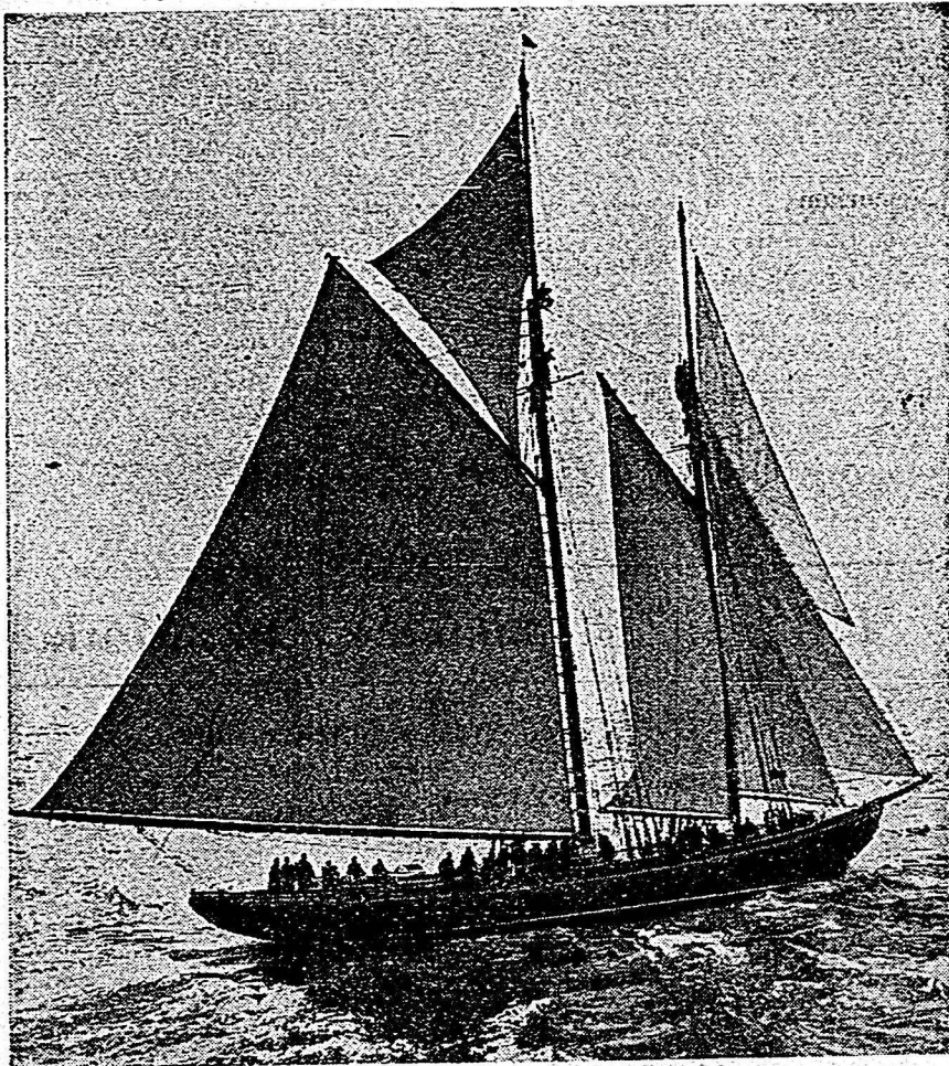
Fastest fishing schooner of modern times, the Bluenose of Lunenburg, N.S., sank off Haiti after hitting a rock or reef. Her crew of eight was rescued. Never defeated in championship contests, the famed schooner was built in Nova Scotia in 1921.