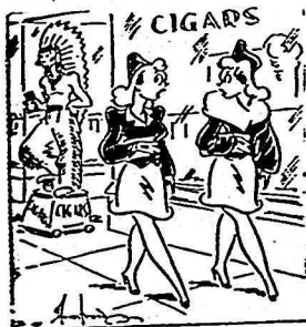
"Did you whistle, I hope?"