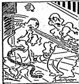
"Stop sneezing at me!"