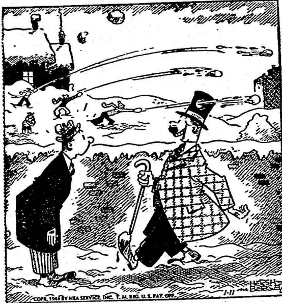
"The odds are better since I cut a hole in it!"