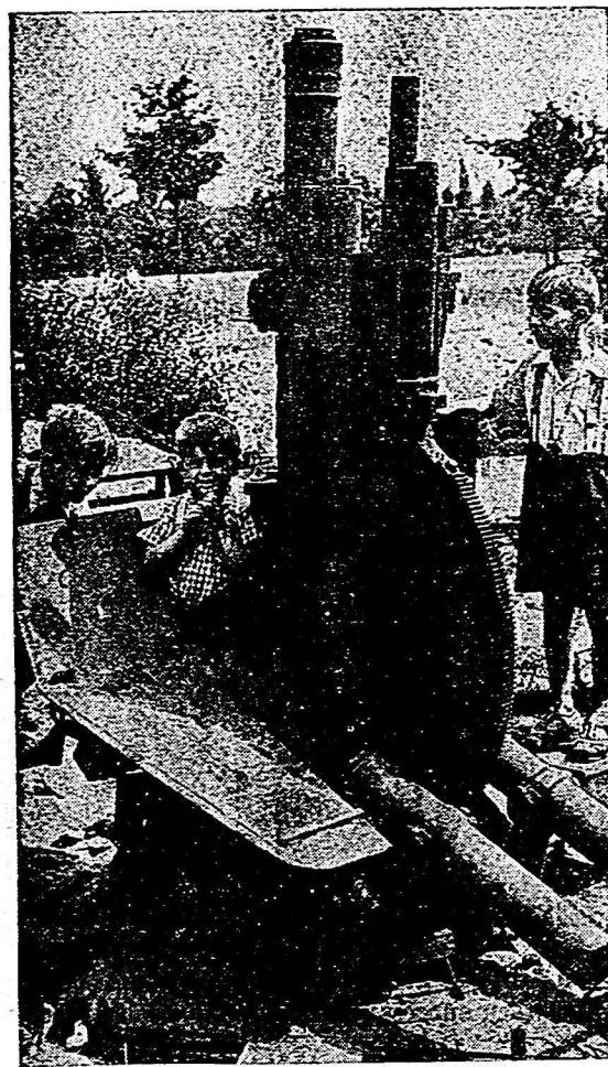
Kris Kringle won't need to bring German children any guns for Christmas—they have plenty left over from the war to play with. Here three boys have fun playing with a wrecked 20-mm. anti-aircraft piece near the Olympic Stadium in Berlin. Gun was put out of commission by the Allied bombing.