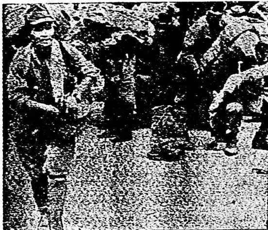
Jap demobilization speed-up is jamming the country's railroads with soldiers returning home. Group above is loaded with packs containing shoes, blankets, equipment... and possibly "souvenirs."