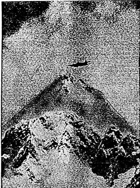
This all-wood Mosquito, Britain's two-engined bomber said to be the world's fastest, soars over Mount Everest, world's highest mountain, in temperature 17 degrees below zero.