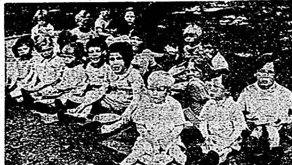
An "after supper" scene at one of the British nurseries maintained by Canadian Junior Red Cross. Juniors send clothing to children in the nurseries twice a year. Nurseries are maintained at an annual cost of about $41,000, raised by the pennies of Canadian school boys and girls.