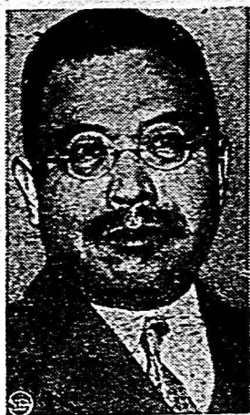
Baron Kujuro Shidehara, 73-year-old liberal, has been named Premier of Japan. He has pledged unstinted cooperation with Allied occupation authorities. He has been authorized by Emperor Hirohito to form a new cabinet.