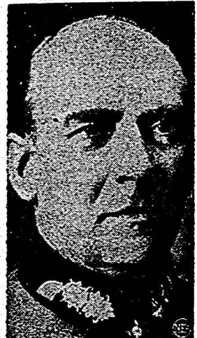
Following his capture at Rammstein, Germany, Gen. Nikolaus von Falkenhorst, former Wehrmacht commander in Norway, declared the Allies have liberated Germany from a "system of gangsters" and that the German army knew all along it couldn't beat the United States.