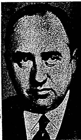
Dr. Walter Funk, above, president of the Reichsbank, and Hitler's minister of economics, was among 200 Nazi government officials captured by U. S. Seventh Army. A dyed-in-the-wool Nazi, Dr. Funk tried desperately to win South America over to Hitler's side and is credited with pulling the Balkans into the Nazi economic orbit.