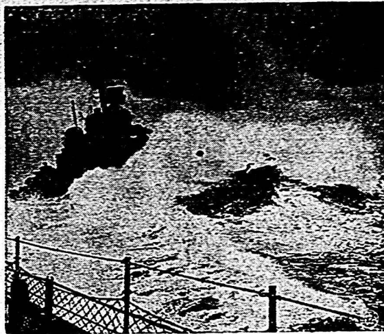
A destroyer of the U. S. Fifth Fleet takes a big white one right over the foredeck while ploughing through heavy Pacific seas on the hunt for the elusive Jap navy.

THE WINNER in coffee popularity is Maxwell House. More people buy it than any other brand in the world! It's All Purpose Grind suits any type of coffee maker.