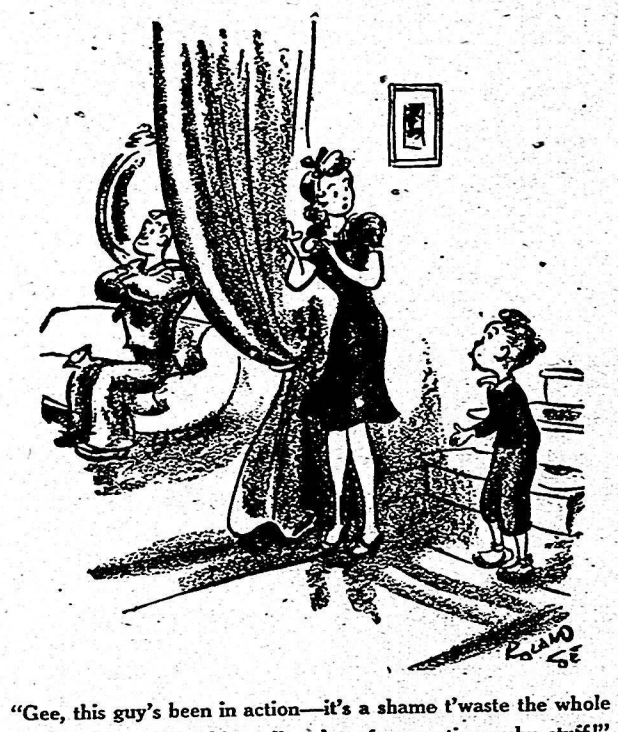
"Gee, this guy's been in action—it's a shame 'waste the whole evening just makin' him talk a lot of romantic mushy stuff!"