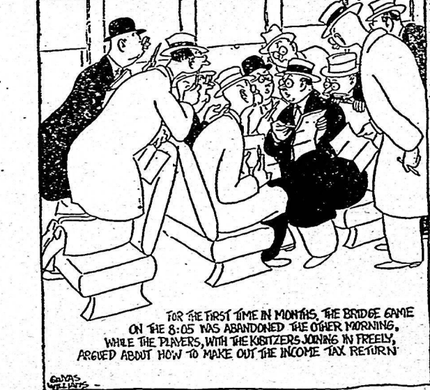
FOR THE FIRST TIME IN MONTHS, THE BRIDGE GAME ON THE G-15 WAS ABANDONED. THE OTHER MORNING, WHILE THE PLAYERS, WITH THE KUSTIZERS JOINING IN FREELY, ARGUED ABOUT HOW TO MAKE OUT THE INCOME TAX RETURN.