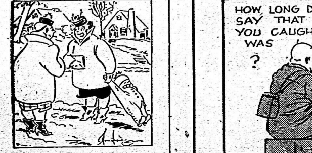
"Well, I'd better be running along before Junior gets cold!"