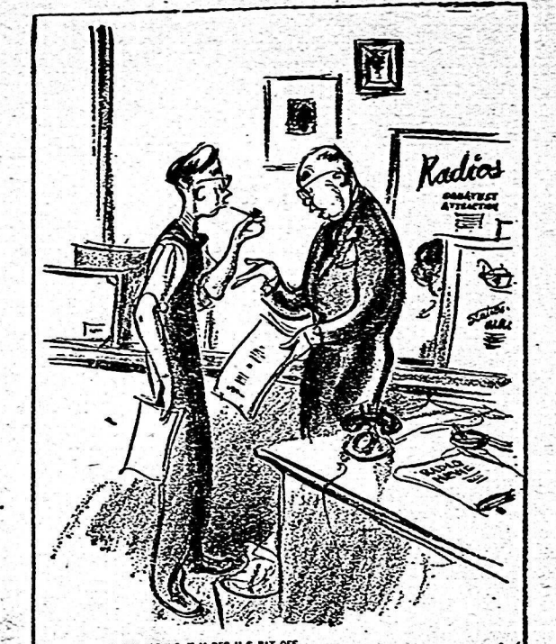
"Sorry, old man, but your radio script that we enthused about six months ago is out! The sponsor's first wife liked it, but his new one won't have any part of it!"