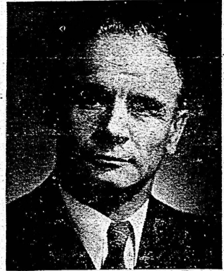
JOHN BRACKEN LEADER OF THE PROGRESSIVE CONSERVATIVE PARTY

I have been asked many times why I am such an ardent supporter of John Bracken. My answer to this question is always the same—I support John Bracken because I believe that Canada must have an honest, straight-thinking, plain-speaking man at the helm... a man with the rare qualities of leadership and humanity, who will set a new standard in public life in Canada. John Bracken is such a man.