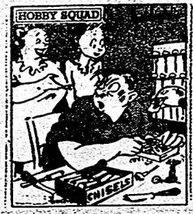
"I am not! I'm a CARVER!"