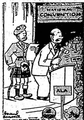
"Sandy McSandy will now address you on 'Free Enterprise!'"