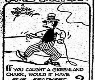
ANSWER: Scales. It's a species of trout.