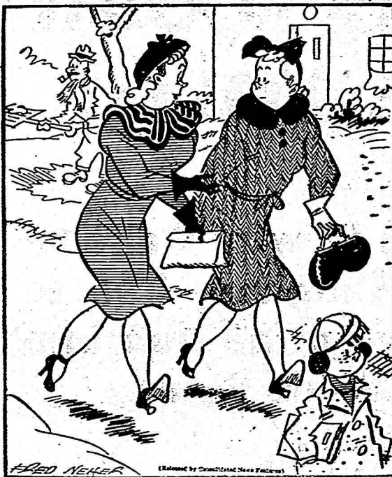
"Whitney gets so angry he slams the door as he goes out—but you oughta see how carefully he opens it when he comes in."