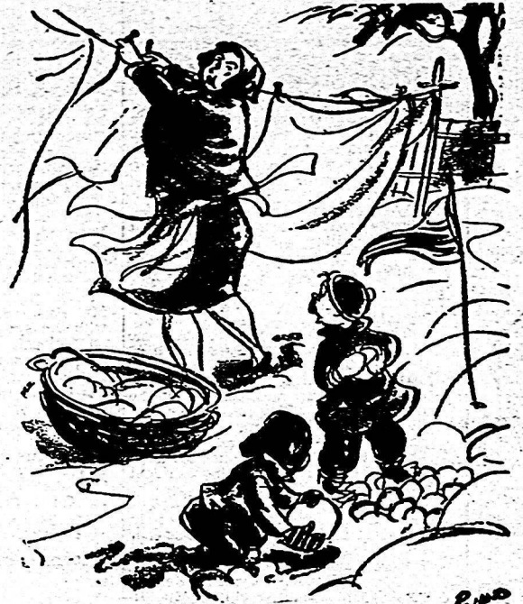
"Geo whiz, Mom! Y'mean we gotta evacuate this fort before we've even fired a shot?"