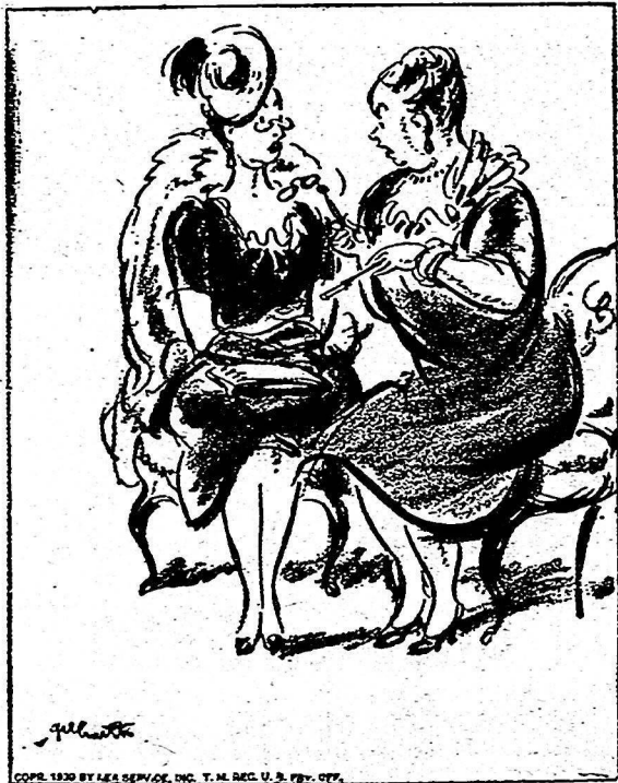
"My doctor said I had an inferiority complex before I talked him out of it."