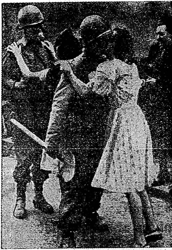
French lassies, joyful over their liberation from Nazi rule, greet Allied troops entering Paris with hugs and kisses. The boys just grin and bear it.