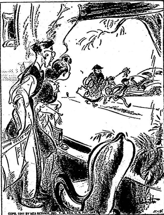
"Here come your Uncle Dan, Aunt Maude and the kids! They're pretty prompt about paying back that summer visit!"