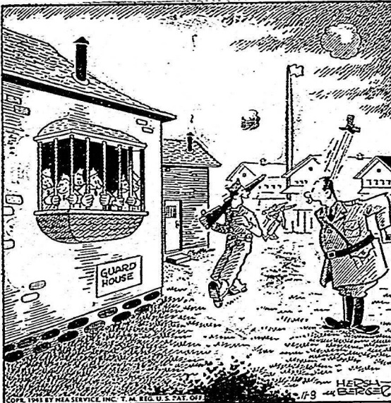
"The contractor built this one with a bay window—it makes it more homey!"