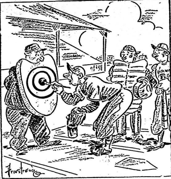
"Do you mind?"