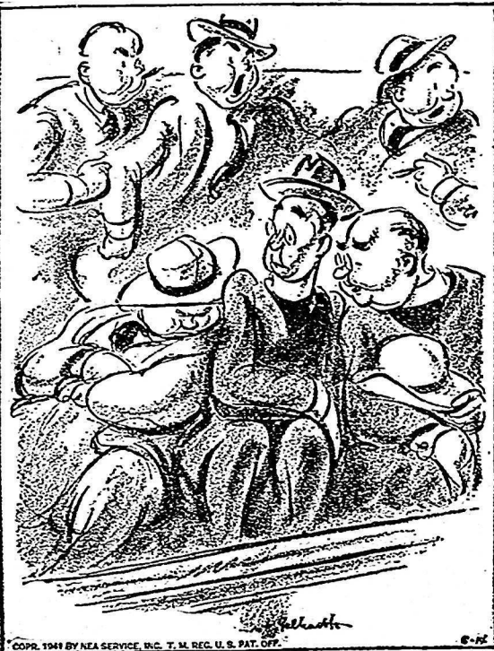
"How comforting! They go to sleep at ball games, too!"