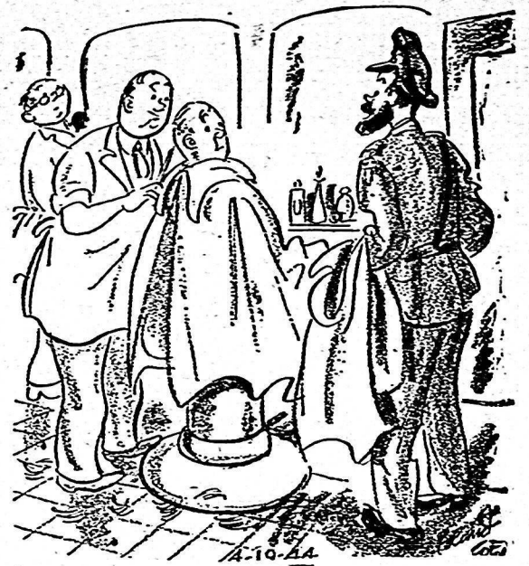
"Remember how you fellows laughed when I used to ask for a shave a couple of years ago? I brought this all the way from China so you could see it!"