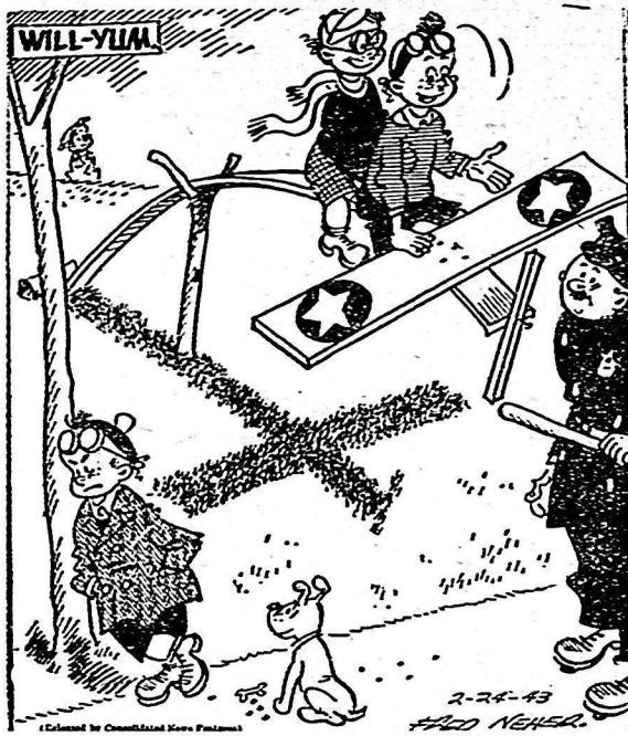
"He's been grounded for two days."