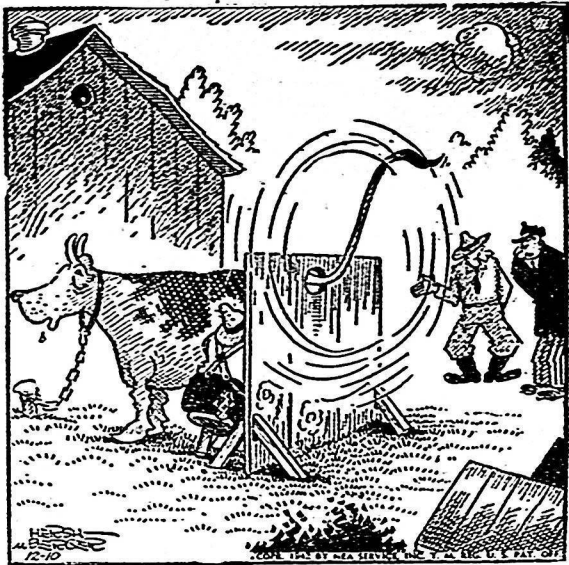
"The hired hand finally found a way to keep his hat from being switched off all the time!"