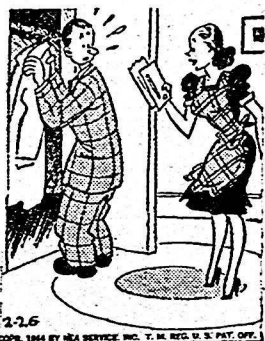
"Here's the mail, dear—an offer of a swell job from Blotz & Co., and your draft notice!"