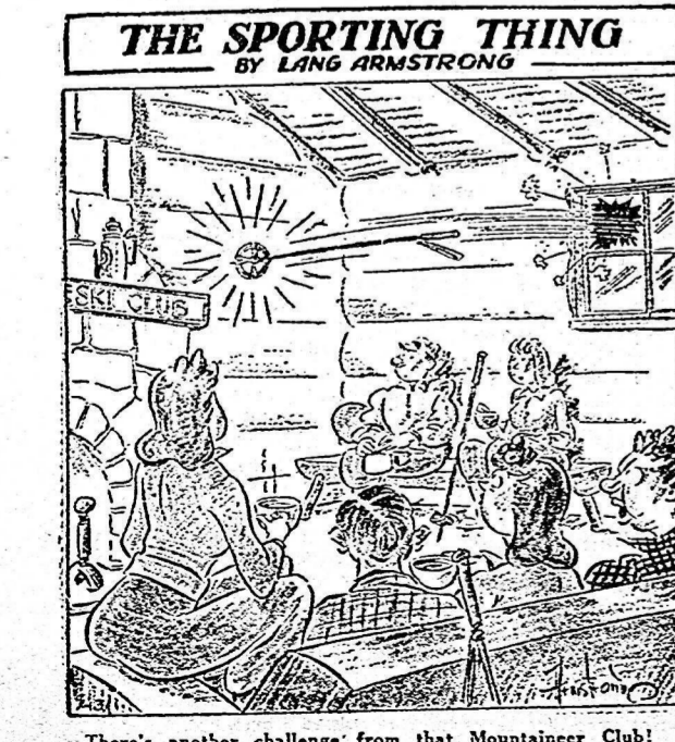
There's another challenge from that Mountaineer Club!