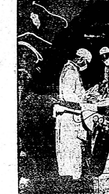
The "surgery" is a dugout, four feet underground, deep in the jungle of Bougainville Island. Stacked packing cases make the operating table. Sandbag walls and heavy log roof protect occupants from enemy fire. Here a U. S. Army Medical Corps team performs an emergency operation.

CLASSIFIED ADVERTISEMENT HARRIS BROS. HARRIS BROS. 125 E. ADAMS ST. CHICAGO, ILL. 4-2200