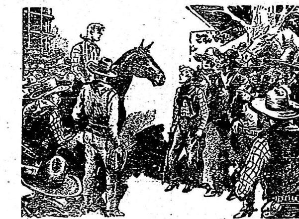
"Yuh ain't got nothing to say?" sneered Curran.

Disheveled, the clothes almost torn from the upper part of his body, Dave was thrust forward. "Here y're, Miss Lois," shouted Curran exultantly. "Here's the measly skunk who killed yore dad, and y're goin' to have the honor of touchin' him off, accordin' to custom."