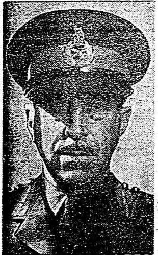
Canadian troops in the Mediterranean war theatre have been expanded to constitute a Canadian Corps, and Lieut. Gen. H. D. G. Crerar (shown) former Chief of the General Staff has been appointed to command of the Corps.