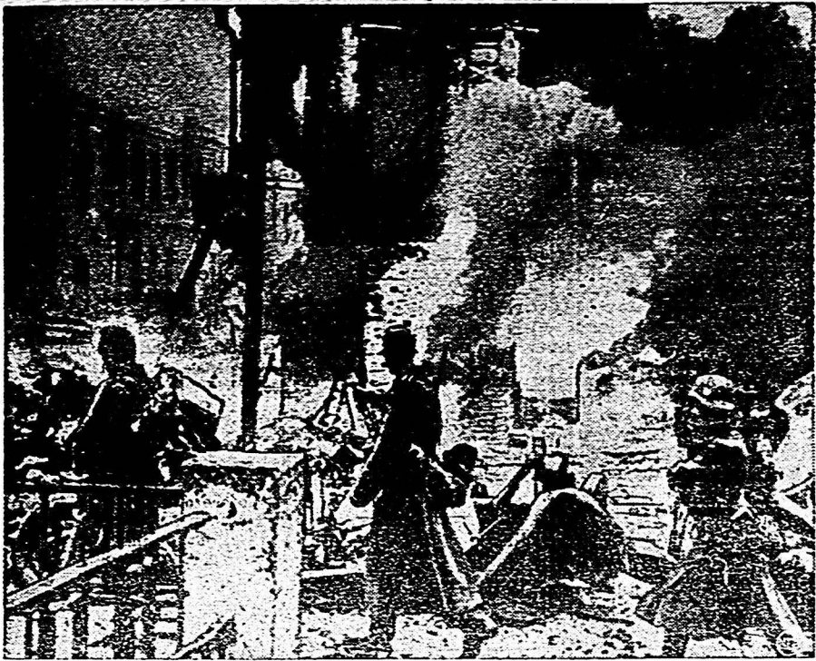
These Nazis, part of more than 300,000 troops forced to retreat in the Kiev sector through a strategic blunder by the German command, take a last look at this burning Russian village which they systematically destroyed before deserting it.