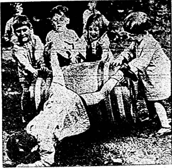
Kids and a keg make for gay sport at Kensington, England, where these children of British war workers are playing in a nursery. Object of game is to stand on top of the rolling barrel.