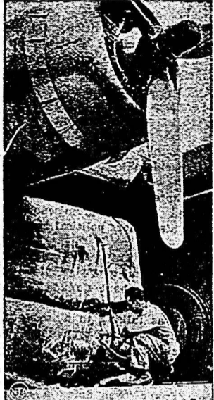
Fixing up a Flying Fortress in England, an American mechanic inflates the British "lifting bag" that acts as a jack and raises the wing of the plane.