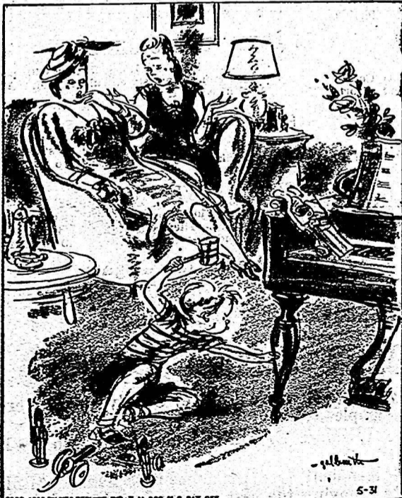
"After your second child, you give up trying to protect the furniture!"