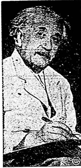
Math wizard Dr. Albert Einstein of Princeton, N. J., is helping the fight against his old enemy Hitler by doing research work for the U. S. Navy.

thee hence, Satan: for it is written, Thou shalt worship the Lord thy God, and him only shalt thou serve." Whenever we do what Satan wants us to do, then Satan has taken the place of God for us, and we have put Satan's will before God's will.